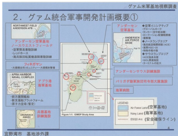
A Map of Guam from the Guam Integrated Military Development Plan, translated and analyzed by Ginowan City

This plan has been around for three years. Now the environmental assessment has been done and the Environmental Impact Statement issued. Once revised in accord with opinions received, the plan will, if approved, then be implemented. Approval is anticipated by July 30, 2010.