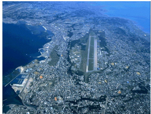
Aerial view of densely populated Ginowan City, with Futenma Air Station occupying 25% of the city's land.

my submissions. The Futenma Problem has really become a problem for the government, but the issue has tended to be one of whether or not to move the base to Henoko. However, although the U.S. government has been steadily moving ahead with plans to move the Futenma Marines to Guam, and the Japanese government is spending $6 billion towards funding the move, the Japanese people and Diet, and the people of Okinawa, have never been given a proper explanation of these plans. In the U.S., various documents, including an Environmental Impact Assessment on the relocation of the base to Guam, have been made public; I want to make this known in detail in Japan. The problems surrounding Henoko and U.S. bases within Okinawa Prefecture should be reviewed. The question is: why should a base be required in Henoko when most of the Marines in Okinawa are being relocated to Guam, and the Futenma Base itself is going to be moved to Guam.