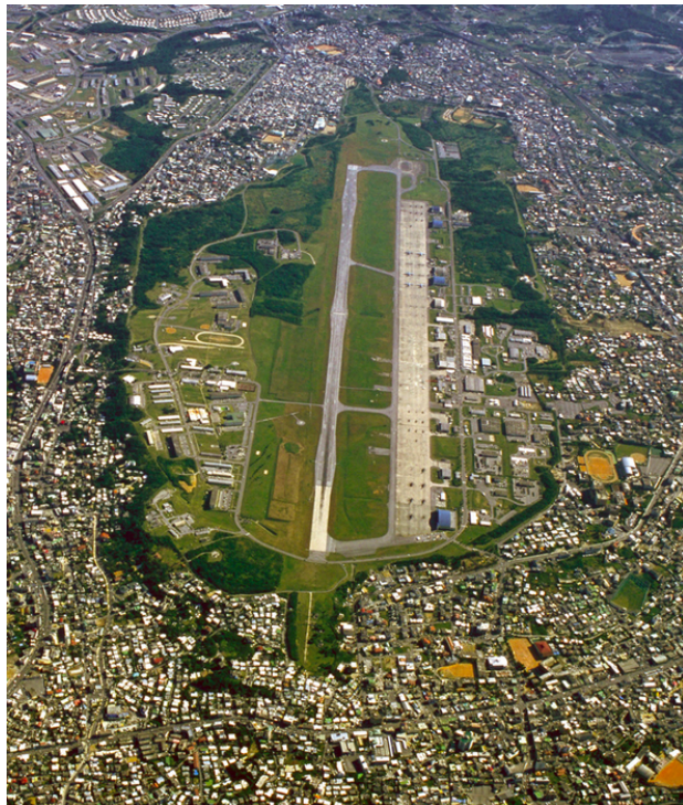
Futenma Marine Air Station surrounded by Ginowan City

US bases remain intact, taking up one-fifth of the land surface of Okinawa's main island. Nowhere is more overwhelmed by the US military presence than the city of Ginowan, which has grown around the US Marine Corps Futenma Air Station. The US and Japan agreed in 1996 that Futenma would be returned, but made return conditional on construction of a replacement, which would also have to be in Okinawa, and not just anywhere in Okinawa but in environmentally sensitive north, the coral and forest environment of Henoko in Nago City, where a precious colony of blue coral was discovered only in 2007, where the internationally protected dugong graze on sea grasses, turtles come to rest, and multiple rare birds, insects, animals thrive.. Thirteen years on, there the matter still stands.