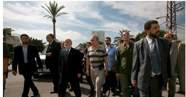
Richard Goldstone (in short-sleeve shirt), Head of the UN Fact Finding Mission on the Gaza Conflict, which produced the September 25, 2009 “Goldstone Report”

It seems clear that with Israel-Palestinian negotiations long stalled, while Israel continues its inexorable building and consolidation of illegal settlements, that the Japanese diplomatic position, if it is a serious one, requires a focus on the positive steps the world community can take (such as the Javier Solana proposal) to finally implement 242.