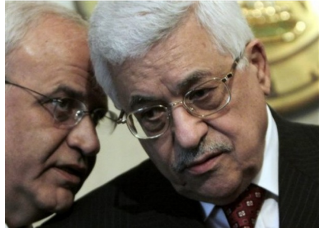
Palestinian President Mahmoud Abbas, right, consults with Chief Palestinian negotiator Saeb Erekat, left

The visit came several days after the Palestinian leadership announced a medium-term plan to go to the United Nations to ask for a declaration of a Palestinian state within 1967 borders (i.e. in the West Bank and Gaza). The move comes because the Obama administration's attempts to restart the peace process have failed. The Palestinian leadership had made an Israeli settlement freeze a prerequisite for new talks, and so refused to sit down with the Israeli government as long as the latter continued to build on Palestinian land (Palestinian Authority President Mahmoud Abbas has dismissed Israel's moratorium on new settlement construction because it did not apply to several thousand housing units and public buildings in the West Bank and to eastern Jerusalem).