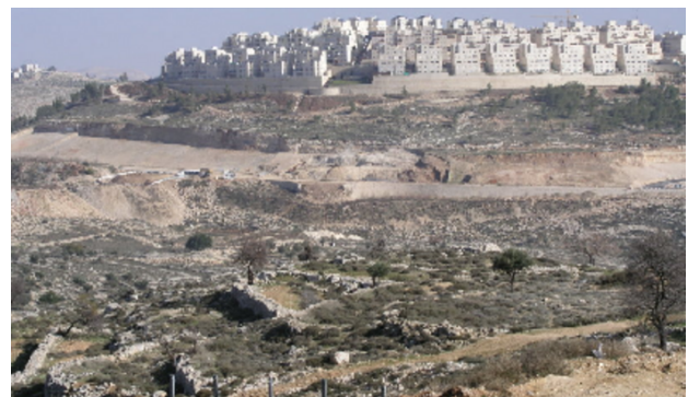
Israeli settlements in the West Bank designated for development funding in December 2009

harder." United Nations Secretary-General Ban Ki-moon reacted to Gilo by affirming "his position that settlements are illegal, and calls on Israel to respect its commitments under the Road Map [a peace plan that foresees two Israel and Palestine states living side by side in peace and security] to cease all settlement activity, including natural growth." The current Swedish president of the European Union stressed that the EU's position is that "settlement activities, house demolitions and evictions in East Jerusalem are illegal under international law." Importantly, the president also noted that "such activities... threaten the viability of a two-state solution" and that the EU "has never recognized the annexation of East Jerusalem in 1967 nor the subsequent 1980 basic law," in which Israel claimed Jerusalem, including the occupied eastern half, as its "undivided" capital.