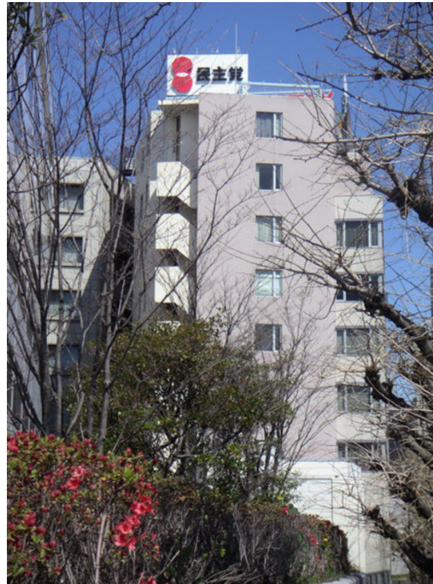
Democratic Party of Japan (DPJ) headquarters in Tokyo