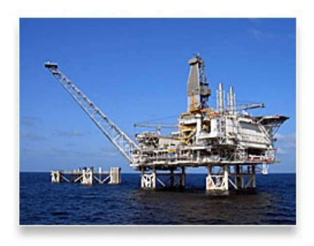
ACG Oil Project in Azerbaijan

Among other projects in the region, Japan's Itochu Oil Exploration and Inpex have a 3.92% interest and 10% interest, respectively, in a production-sharing agreement (PSA) for three fields in the South Caspian Sea. The Azeri-Chirag-Guneshli (ACG) fields are located approximately 120 km southeast of Baku in Azerbaijan. The Japanese government-backed Inpex also has an 8.33% interest in the Kashagan oilfield in Kazakhstan.