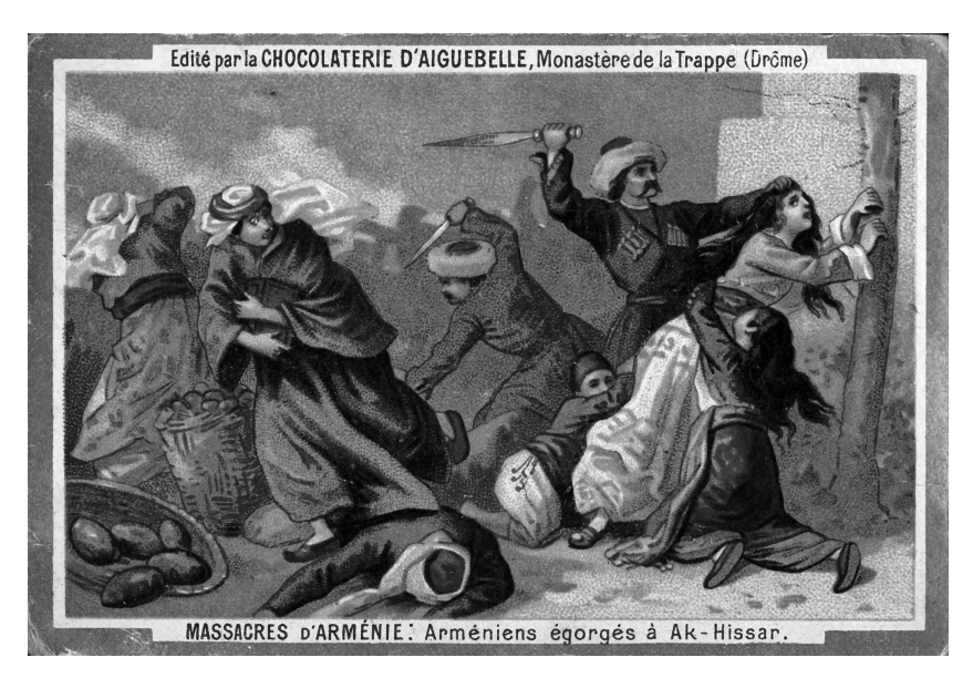
Image 1 Massacres d'Arménie: Arméniens égorgés à Ak-Hissar, c. 1895–96, by Chocolaterie d'Aiguebelle (Drôme, France). Chromolithographic chocolate card. Kislak Center for Special Collections, Rare Books and Manuscripts, University of Pennsylvania Libraries. Caption on the reverse states that the image depicts Armenians massacred by Circassians in the market at Ak-Hissar, in the Vilayet of Ismidt, on October 3, 1895.

art, French monarchs and their castles, maps of the French Empire, and so forth?<sup>21</sup> For the person nibbling on chocolate, and considering the cards that came in its wrappers, the images may have reinforced the notion that in the Ottoman Islamic world, outrageous sectarian violence between Muslims and Christians was common to the point of mundane. These cards, which as a "democratic art" were items that many schoolchildren collected and traded,<sup>22</sup> broadcast news in western Europe about grim conditions for Christian Greeks and Armenians farther east. (Certainly the D'Aiguebelle monks regarded them as vehicles for promoting a "Christian conscience" and social "catechism," particularly among children, who were their target audience.<sup>23</sup>) Like the French picture postcards of the same period, which presented studiostaged fantasy portraits of seminaked (but still head-veiled) Algerian Muslim women, these D'Aiguebelle chocolate cards advanced fantasies and stereotypes about the peoples of the "Orient."<sup>24</sup> As humble as they were, the chocolate cards wielded power and contributed to the waging