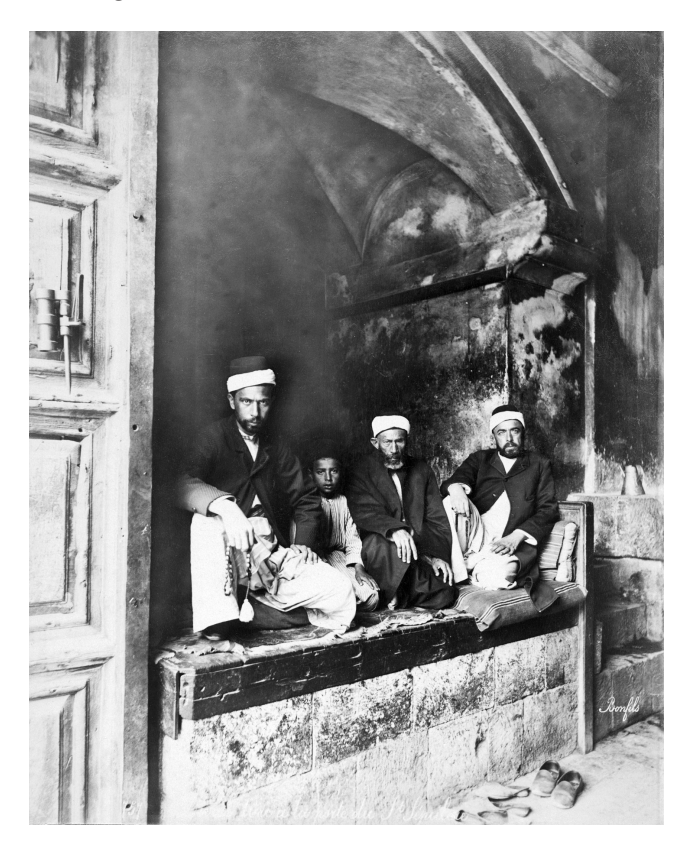
Image 2 "Guard turc à la porte de St. Sepulchre" (Turkish Guard at the Gate of the Church of the Holy Sepulchre, Jerusalem), c. 1885–1901, Bonfils Collection, Image Number 165914. Courtesy of the Penn Museum.

The method used here is to draw not only on history books, but also memoirs, cookbooks, novels, anthologies, ethnographies, films, and musical recordings, which can offer insights into cultures of contact. However impressionistically, such sources can yield insights into the history and anthropology of the senses – the sounds, tastes, touches, and smells that have added up to shared experience.<sup>36</sup> One can find evidence for contact and affinity, for example, in shared Arabic songs and stories, sung or recounted by Muslims, Christians, and Jews;<sup>37</sup> in the remembered smell of jasmine blossoms, threaded and sold on strings after dusk; in "recollections of food" that "have been wedged into the emotional landscape,"<sup>38</sup> like a particular bread sold on street carts during