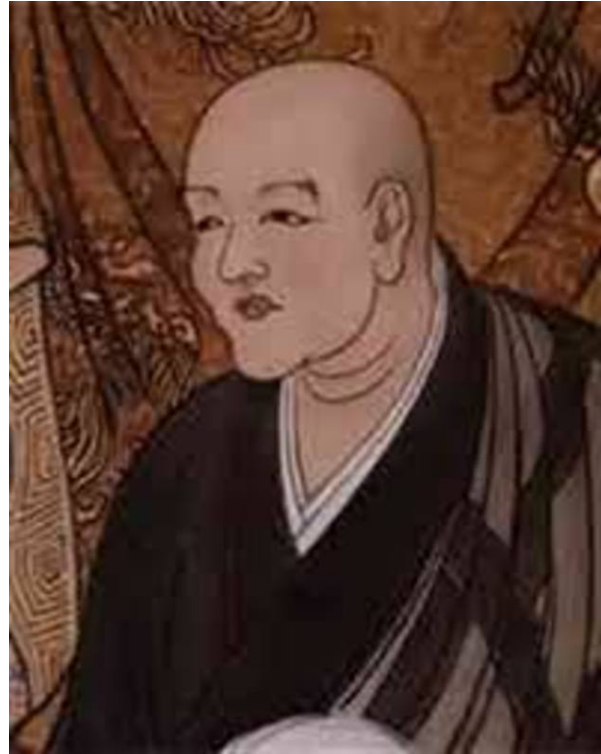
Zen Master Dōgen

The idea Sawaki advanced here concerning killing was a popular position advocated by Zen exponents, including D.T. Suzuki. In his now classic Zen and Japanese Culture , Suzuki wrote: