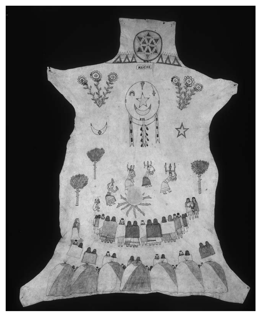
FIGURE 1.1 An Ndé painted deerskin by Naiche, ca. 1909.

young men callously killed the Vaquero leader, despite the fact that he had held up a rosary from Benavides from around his neck.<sup>5</sup> And yet, several years later in 1629, after a brief uprising, Vaquero Apaches still wanted to become Christians. Within five years not only had many converted, but they were "all at peace" with Spaniards.<sup>6</sup>