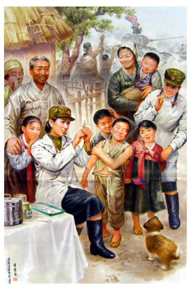
"Day of vaccination" by Jong Myong-il, Juche 96 (= 2007)