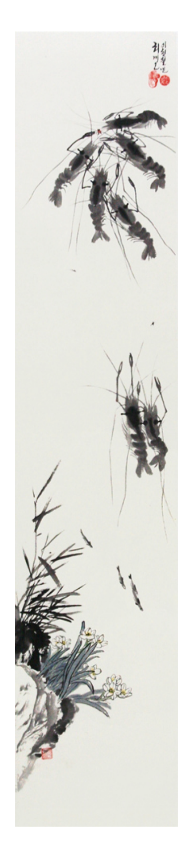
"Shrimps" by Choi Gye-keun

So much for the complicated background of the exhibition. But what can we actually see there? Large ink drawings, many of them in color, show mostly landscapes, animals or plants: Torrents, canyons, mountain lakes, cherry blossoms, eagles and a swarm of shrimps. In fact, these light subjects were "allowed" by Kim Jong-il only in the 70s.