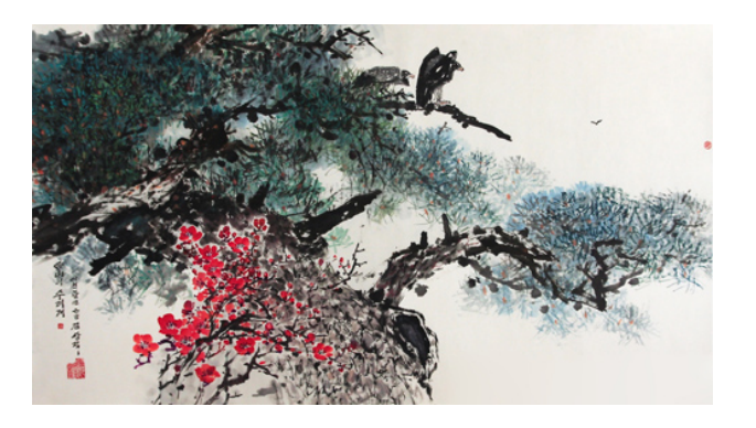
"Eagle of Mt. Baekdu" by Kim Sang-jik, 2008

First, many of the seemingly apolitical subjects have specific ideological implications. For example, Mount Baekdu, the worshipped site of Korea's mythical foundation, can be seen in numerous pictures, in varying styles and from different perspectives. According to his official biography, however, Mount Baekdu is also the birthplace of Kim Jongil.