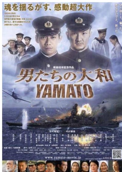
Advertisement: Yamato "rattles the soul"

One could argue that this emptiness is a product of the fact that these films, both of which are fantasies, do not carry the burden of the real memory of WWII and its aftermath. What of the recent films that take up actual historical moments and figures, such as kamikaze pilots or other suicidal missions? Yamato ( Otokotachi no Yamato , 2005), for instance, about the final days of the famed battleship, was a significant box office success, grossing ¥5.1 billion in ticket sales, the fifth best selling Japanese film in a year when Japanese movies out-grossed foreign films for the first time since 1985 (it was also the most successful Japanese war film in decades).