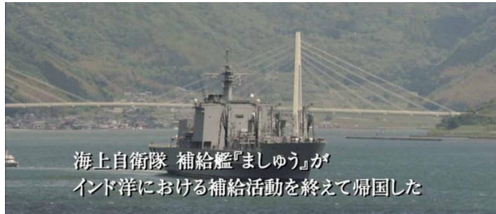
Hidden reality: MSDF ships on a “refueling mission”

in the film through absurd plot inconsistencies (how on earth could Kamio not know Uchida had survived?) and the blatant inability to acknowledge contemporary political reality (i.e., showing MSDF ships returning from a “refueling mission in the Indian Ocean” without daring to state this is part of Japan’s support for the Iraq War).