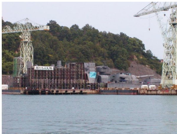
Remembering war through its reproduction: the movie set at Onomichi

Kamio's trauma can only be solved by becoming similarly circular. On the personal level, it is the assertion that he has lived in order to remember and memorialize the dead. This is a common refrain in war films, but it doesn't answer the traumatic question of why these young men died, especially in a film that minutes before questioned the meaning of their sacrifice. If Kamio lived to memorialize the dead, did they die only that so that they could be memorialized? This perverse circularity is somewhat reinforced on the collective level by the film's quotation of the legendary statement made by Lieutenant Usubuchi Iwao 10 on the Yamato the day before its final battle: that Japan can only progress through defeat, and that the Yamato's demise