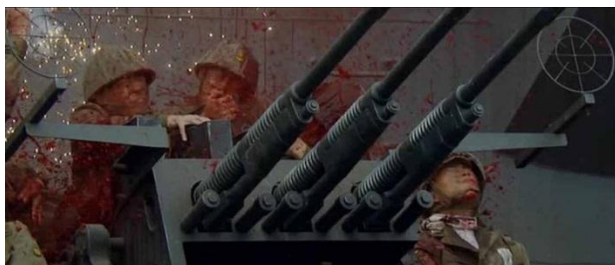
A vicariously traumatic depiction of young deaths

Yamato was in some ways a traumatic film for spectators, too. Viewer comments on Yahoo Japan and other sites often describe the difficulty of speaking or communicating after the film, as if aphasia was one of its effects. What tends to be shocking is less the general narrative of the loss of the Yamato , than the way the innocent young recruits are killed through quite graphic cinematic representation.