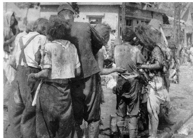
Atomic Bomb survivors at Miyuki Bridge, Hiroshima, two kilometers from Ground Zero. August 6, 1945.

of critical events and poses controversial issues for student reflection. Hakim alone among the texts consulted presents students with the overwhelming visual spectacle of destruction of the atomic bombing of Hiroshima and Nagasaki from the vista of the bombed out city of Hiroshima to survivors in Nagasaki the day after the explosion, to a woman whose skin was burned in the pattern of cloth she was wearing when the bomb struck. [2] Gary Nash and Julie Jeffrey's The American People shows no actual human victims, but it presents an Osaka department store exhibit displaying a pictorial version of the victims in agonizing flight. In examining the texts, one is reminded of U.S. World War II regulations and subsequent wartime censorship most notable in the Afghan and Iraq Wars, which barred media publication of dead and mutilated bodies, whether of soldiers or civilians, U.S. or enemy. [3]