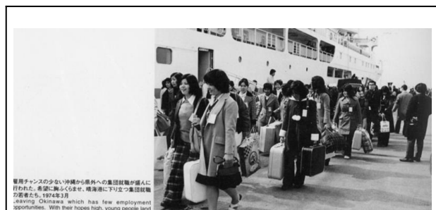
Young Okinawan workers arrive at Harumi

After travel restrictions ended with Okinawa's reversion to Japan in 1972, more people went to the mainland for work and study. Some settled there, but most returned to Okinawa even though it offered fewer employment opportunities. A survey conducted in 2000 estimated that 70,000 migrants and their descendants resided in Osaka Prefecture, mostly in Osaka City; 12,000 in Hyōgo Prefecture, mostly in Kobe and Amagasaki Cities; and 45,000 in Kanagawa Prefecture, mostly in Yokokama and Kawasaki Cities, for a combined figure of 127,000 in those three prefectures. While there is considerable movement back and forth, the total number of Okinawans currently residing on the mainland has been estimated at 300,000, between 20 and 25 percent of Okinawa Prefecture's 1.3 million population. 8 Although fewer now live in what have been called "ethnic communities," many maintain close connections with other Okinawans on the mainland. 9