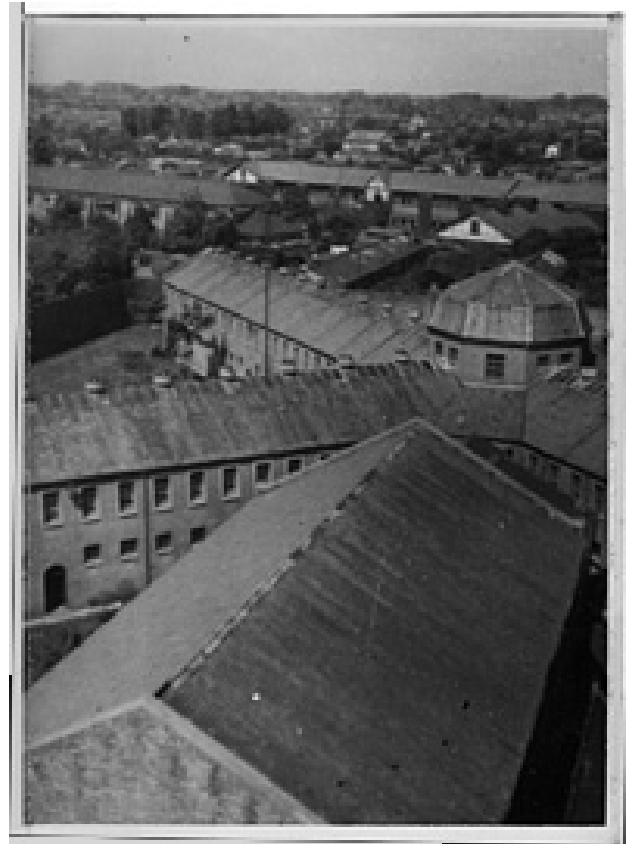
Exterior view of the Eighth Army stockade with its “x” design.

However, even my uncle said that the inmates he guarded, the ones I’m researching, were bad. He served as an MP in the Eighth Army stockade in Nakano the largest American military prison in Japan, from April to June