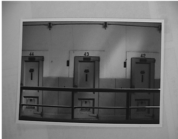
Interior view of Eighth Army Stockade.

and announced that the facility had become overcrowded and that they were going to have to start executing. The captain then had a gallows built and decorated it with black bunting. “He took care of the problem,” said my uncle, and his tapes end there.