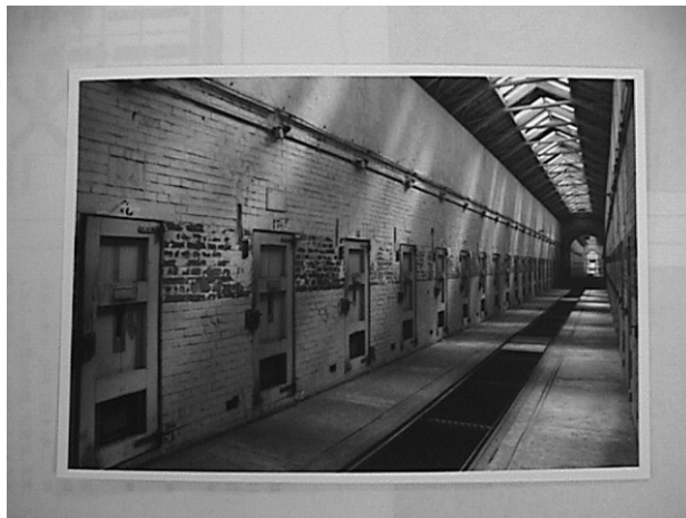
Outside of the cells in the Eighth Army Stockade.

Armies can make mistakes. Innocent soldiers can be killed or at the very least, their paperwork lost. But the only time I ever found anyone's execution papers they were marked "Secret." These records should be transparent, easy to discover and above all, truthful. Suspicion rears its ugly head if they are not.