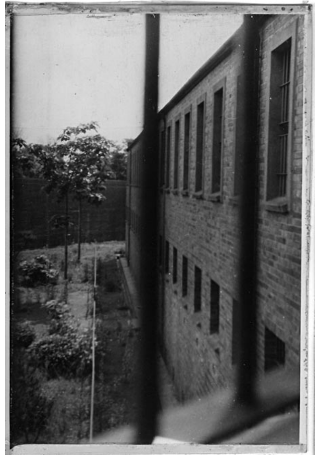
Window from the guard's barracks in the Eighth Army Stockade.