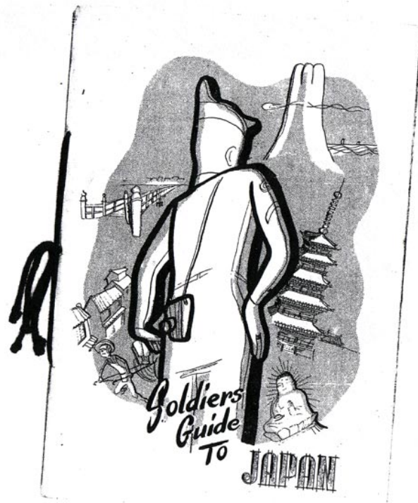
"Soldiers Guide to Japan." Eighth Army Printing Plant, c. 1946.

General Eichelberger twice had to admonish his forces about their behavior in Japan, citing looting, rape and robbery. [38] In 1946 General Eisenhower ordered a report on troop behavior in 1946 of both Japan and the Philippines. (The National Archives in the U.S. have this report's cover sheet, but not the report.) [39]