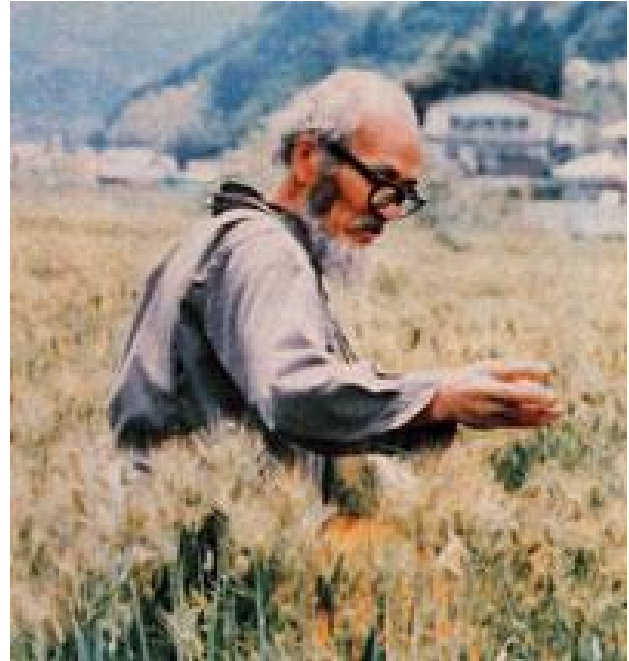
Fukuoka in the field

to the point where my natural farm could yield, without any effort, virtually as much rice and wheat as typical scientific farms."