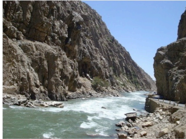
Panjshir valley, area of Northern Alliance dominance