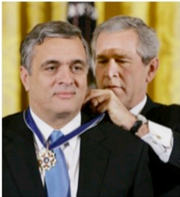
President Bush awarding National Medal of Honor to George Tenet, Dec. 14, 200