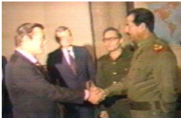
Saddam Hussain and Donald Rumsfeld in 1983

This confession was reported to the prosecutor and to the judges and it influenced their minds: it helped to convince Cooke, for instance, that "the King must die and monarchy with him." Charles Stuart had no remorse, so he deserved to die. This was Cromwell's fatal mistake: the King's execution made him a martyr, and paved the way in public sentiment for the restoration of the monarchy eleven years later. (It is a mistake about to be repeated: the execution of Saddam Hussein will most likely tip Iraq into full-blooded civil war.)