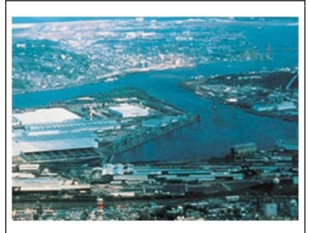
Kitakyushu's Dokai Bay (today)

The tax breaks in the international strategy zone are focused on lowering the corporate tax in order to foster competitiveness in international markets, while those in the regional revitalization zones centre on deductions for individual investment in enterprises that are part of the strategy.