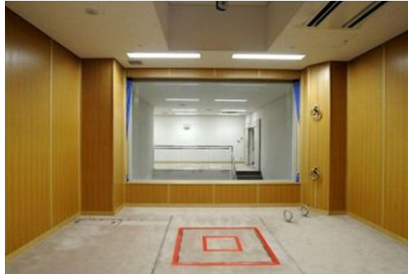
Illustration of Japanese execution room

In my view, the most striking thing about the media coverage of Kijima's trial is how much more of it there was than there was for another long capital trial that occurred a few months earlier. In the latter, Takami Sunao was convicted of killing 5 persons and injuring 10 by setting fire to a pachinko parlor in Osaka in July 2009. Takami was sentenced to death on October 31, 2011, but his trial was epoch-making in that his tribunal had to consider the claim that capital punishment is unconstitutionally cruel because hanging often results in either decapitation or the prolonged suffering of the condemned while he or she dangles at the end of a rope. This was the first time in more than 50 years that the constitutionality of capital punishment was seriously contested in a Japanese trial, and lead defense lawyer Goto Sadato even persuaded Chief Judge Wada Makoto to allow testimony from two expert witnesses: Walter Rabl, the president of the Austrian Society of Forensic Medicine, who told the court that, based on his own extensive studies, hangings are frequently botched; and Tsuchimoto Takeshi, a retired prosecutor who described what it was like to watch a hanging in the 1970s ("when looked at directly, the cruelty of hanging cannot be endured"). Goto also persuaded Judge Wada to ask the Ministry of Justice to disclose information about botched executions and the