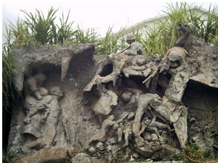
Okinawan sculptor Kinjo Minoru’s relief depicting the Battle of Okinawa, during which many Okinawans were killed or forced to commit suicide after seeking refuge in the island’s caves.

commented: “Give an objective description without bias. Do not lean toward the theory of unconstitutionality [of maintaining SDF]. Provide balance by including the government’s view and other views” (on Article 9 and renunciation of war); “Pay attention to the size [of pictures] and better keep too tragic pictures small” (referring to pictures of Hiroshima and Nagasaki). 31