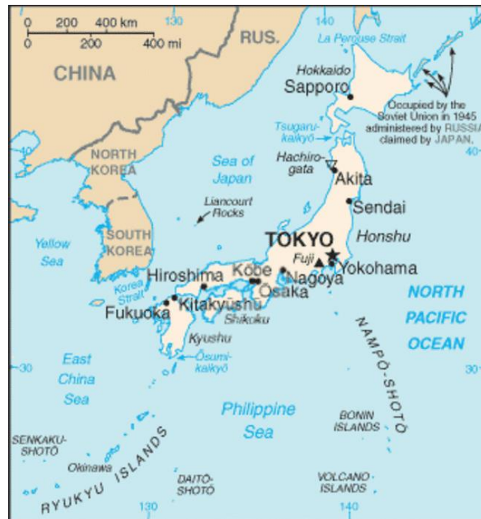
Map showing contested areas including Senkakus and Takeshima (Liancourt Rocks)

The comfort women is merely the most politically explosive of the textbook controversies that have long articulated with, and inflamed, historical memory issues in ways that exacerbate contemporary international conflicts involving Japan, Korea, China, and the United States. Although it may well be the case that the forces most effectively countering Japan's nationalist historical revisionism have been the nationalisms of other nations, 68 we would like to stress that Japanese textbook authors and civic groups working from peace and justice perspectives have constantly fought against the nationalist tide for over more than half a century. There is a need, and a possibility, for people in Japan and other nations to transcend nation-state boundaries and chauvinistic perspectives to humanely address the issues of historical memory and education. 69