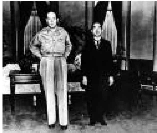
Hirohito and MacArthur, 1945