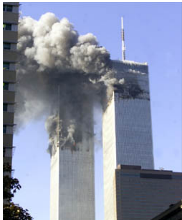
Twin Towers burn after plane attacks

American media coverage of 9-11 and the subsequent war on terror that these events have given rise to a resurgent patriotism in the U.S. not seen since World War II (In this paper I use the American name for the war, World War II). Even in Hawaii, far from the mainland United States, houses along the streets of most neighborhoods routinely display American flags; stores sell flags, pins, and banners; and cars everywhere sport bumper stickers proclaiming national pride and unity. Whether swept up in this renewed patriotism, or worried by the concomitant rise of racism and unchecked militarism, nearly everyone has been affected.