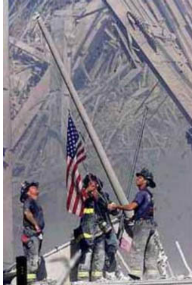
Firemen raise flag in rubble of the World Trade Center. September 11, 2001

Constructing images of patriotic citizenship, of the strong identification of ordinary people with the nation and their willingness to sacrifice themselves for its ideals, has long been the focus for national ceremonies of remembrance. In the United States, such occasions are marked on November 11, Veterans Day, and in the spring on Memorial Day—both days set aside to honor those who have fought (and died) in the nation's wars. To these, we may add Pearl Harbor Day, December 7th and now September 11. Although not a national holiday, Pearl Harbor Day is a national day of remembrance marked with ceremonies and widespread media attention each year.