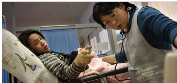
A midwife in Tono in northern Japan conducts an examination. In communities like this, urban obstetricians receive data by remote on their cell phones to advise women when they should go to an urban hospital to give birth.

Pediatric units are likewise endangered. According to the Ministry of Health surveys, 3,938 hospitals had pediatric units in 1994, but this number had fallen to 3,231 by 2004. At the same time, the system for providing nighttime emergency pediatric care has weakened.