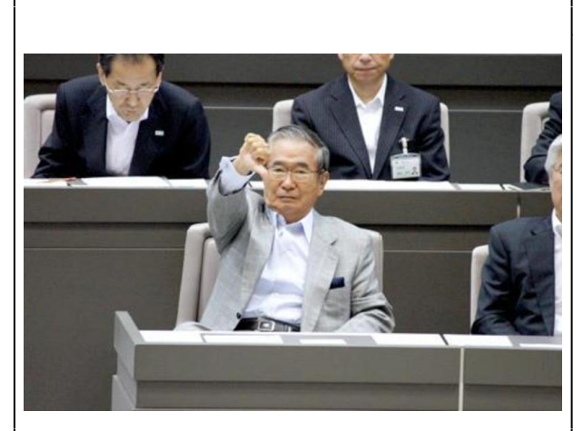
Tokyo Governor Ishihara Shintaro Rejects Petition signed by 320,000 Tokyoites to Hold Referendum on Nuclear Power in June 2012.

Times 8/5/2012) Combined with the tightly scripted format of the meetings, media reports convey the impression that yet again the government was trying to marginalize public opinion and orchestrate the outcome.