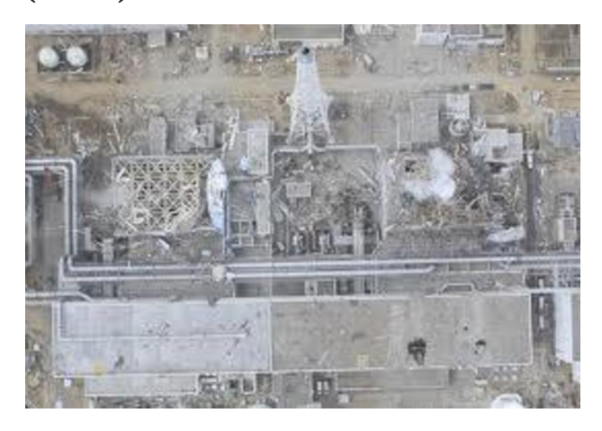
Fukushima Daiichi Nuclear Power Plant (after)