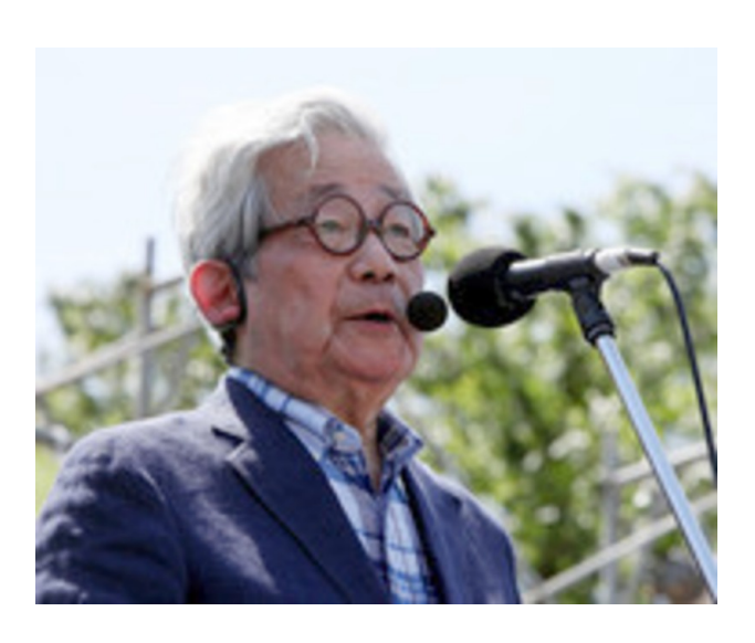
Anti-Nuclear Rally attended by over 100,000 at Yoyogi Park July 22, 2012. Oe Kenzaburo Addresses the Crowd.

Given widespread nuclear anxieties among the Japanese people, and public opinion polls in 2012 showing over 70% favored phasing out or significantly reducing nuclear energy, the nuclear village went into damage control mode. Keidanren and other large business organizations lobbied vigorously to block efforts to downsize nuclear power, citing growing trade deficits due to energy imports and increased business flight overseas because of Japan's high and rising costs of electricity. Pro-nuclear advocates also raised the issue of global warming, pointing out that in the absence of nuclear power Japan could not meet its CO2 emission reduction pledges. In addition, renewable energy was portrayed as unreliable and too costly.