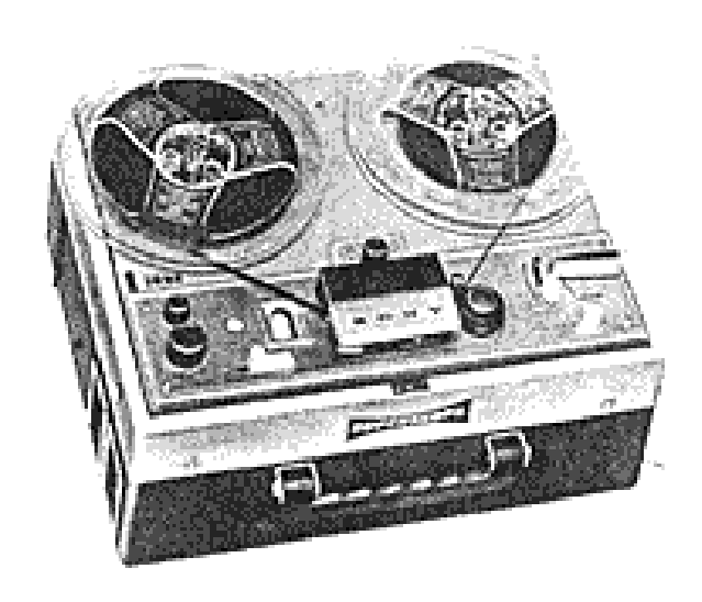
Sony Superscope Tape Recorder, 1957

Japan and Korea do not any longer combine "low incomes and low wages with significant innovative potential" - the third of the "distinct" challenges that China and India are said to pose. But that was arguably the case fifty years ago when Japan had a per-capita GNP that is smaller than China's today at a time when the likes of Sony were seizing on the commercial potential for the transistor. One can accept that "China and India are associated with very different forms of regional integration" - the fourth so-called "distinct challenge." But the picture the authors present of China's integration - "the processing of imported raw materials and intermediates" -has long also characterized Japan's and Korea's economic ties with the rest of the region.