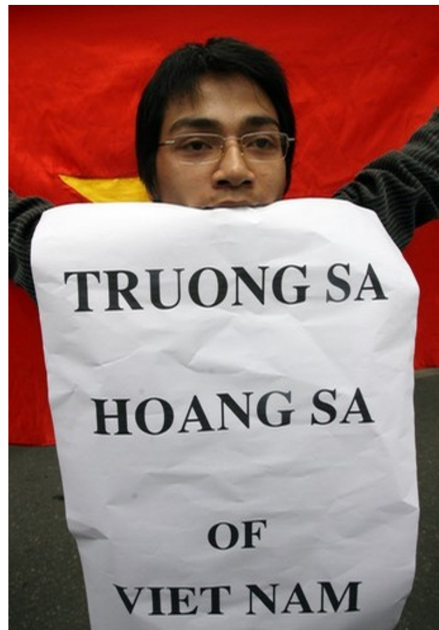
Protester in front of the Chinese embassy in Hanoi. "The Paracels and Spratlys of Vietnam"

allegation—not yet confirmed by the PRC government—that the National People's Congress had passed a law in early December 2007 creating a county-level city in Hainan province called Sansha to administer China's claims in the South China Sea, including the Paracel and Spratly Islands. For the Vietnamese government the Sansha proposal was the last straw. Over two consecutive weekends in December it allowed hundreds of students to conduct anti-China protests near the Chinese embassy in Hanoi and consular office in Ho Chi Minh City. The demonstrators expressed anger over China's claims in the Paracels and Spratlys, accusing Beijing of pursuing hegemonic ambitions (Straits Times, December 17, 2007).