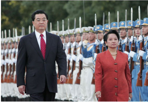
Hu and Arroyo

Three years later, a series of damaging scandals, investigations and controversies have stripped the gilt off this so-called golden age. Allegations concerning corrupt practices associated with the provision of Chinese overseas development aid (ODA) have prompted Congressional investigations, resulting in the cancellation of several major Chinese-backed initiatives, while Arroyo's opponents have called into question the constitutionality of the JMSU. Those seeking to oust President Arroyo have also made explosive allegations linking Chinese loans to the territorial disputes. Events in the Philippines over the past year not only represent a blow to the PRC's "charm offensive" in Southeast Asia, but also a major setback for Sino-Philippine relations, which many hoped had turned the corner.