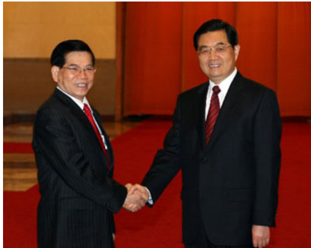
Vietnamese Pres. Nguyen Ming Triet and Chinese President Hu Jintao affirm relations in 2005

stability, orientation toward the future, good neighborliness and friendship, and all round cooperation" in the spirit of "good neighbors, good friends, good comrades, and good partners."