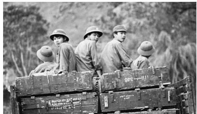
Chinese forces enter Vietnam in the 1979 border war

In 1991, after more than a decade of hostility—the low point of which was a short but intense border conflict in 1979 following Hanoi's occupation of China's ally Cambodia—Vietnam and the PRC normalized relations.