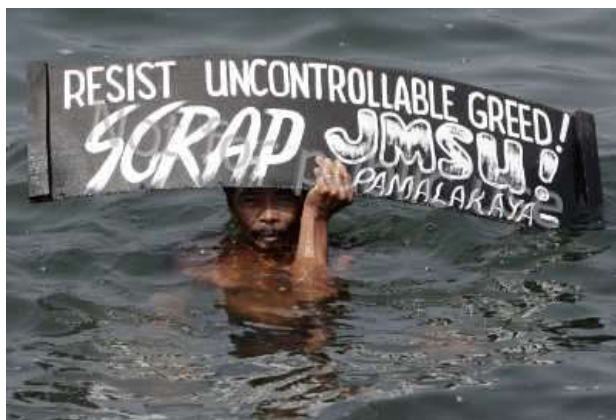
A Filipino fisherman holds a sign calling for scrapping the JMSU

The contents of the FEER article were quickly capitalized on by Arroyo’s opponents, some of whom accused the government of prejudicing the country’s territorial claims in the South China Sea and violating the 1987 Constitution, Article 12 of which stipulates that any consortium undertaking exploratory activities in Philippine waters must be 60 percent owned by Filipinos. Critics assailed the government for selling out the national patrimony; some even called for the president’s impeachment for treason. An even more explosive insinuation followed: that the Philippine leader had agreed to the JMSU as a quid quo pro for Chinese ODA (News Break, March 6). Opposition figures have, however, failed to provide any concrete evidence to back-up this extraordinary and incendiary claim.