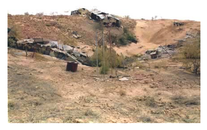
A view of the nuclear test site at Pokhran in Rajasthan