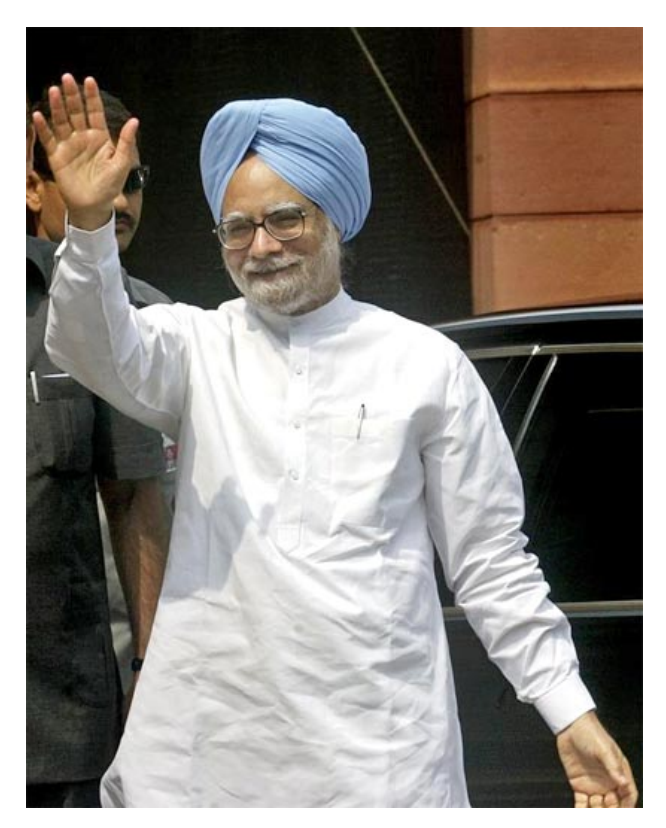
Prime Minister Manmohan Singh

The first lines of Robert Browning's poem, 'The Patriot' - "It was roses, roses, all the way" may well characterise the splendid success of prime minister Manmohan Singh's visit to Japan during December 13-15. It all started with the "breaking of protocol for a late evening arrival at Tokyo International Airport, Haneda, by the Japanese foreign minister Taro Aso". [1] The next day he had an afternoon audience at the Imperial Palace with the emperor of Japan, Akihito, and empress Michiko, followed by a historic honour - a first for an Indian prime minister - to address the joint session of the Diet, the Japanese parliament. The visit concluded on December 15 with a joint public statement, with the prime minister of Japan, Shinzo Abe, on "India-Japan Strategic and Global Partnership".