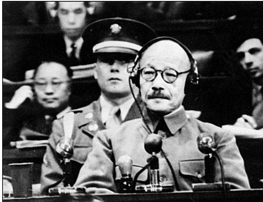
Tojo at the Tokyo Trial

In the postwar, with Japan at peace and occupied by US forces, the shrine has played a role in structuring how the war is remembered and presented to the Japanese people. It did so within a framework crafted by the occupation authorities who exonerated the emperor of all responsibility for initiating or waging war. Indeed, Hirohito was credited by both the occupation authorities and the Japanese government with bringing peace by personally intervening to end the war. Not only would the emperor not be deposed or tried as a war criminal, he would be shielded even from testifying at the Tokyo Trial. 14 The verdict at Tokyo, sentencing Tojo and a small number of prominent military and government officials to death, as well as the convictions of thousands of soldiers and police officials tried in B and C class tribunals, in leaving untouched Japan's supreme wartime leader, essentially absolved the Japanese people of the responsibility to examine their own behavior in the era of colonialism and war. For these reasons, the US as well as Japan ultimately shares responsibility for resolving issues of war responsibility that it helped to create, including those associated with the emperor and with Yasukuni Shrine.