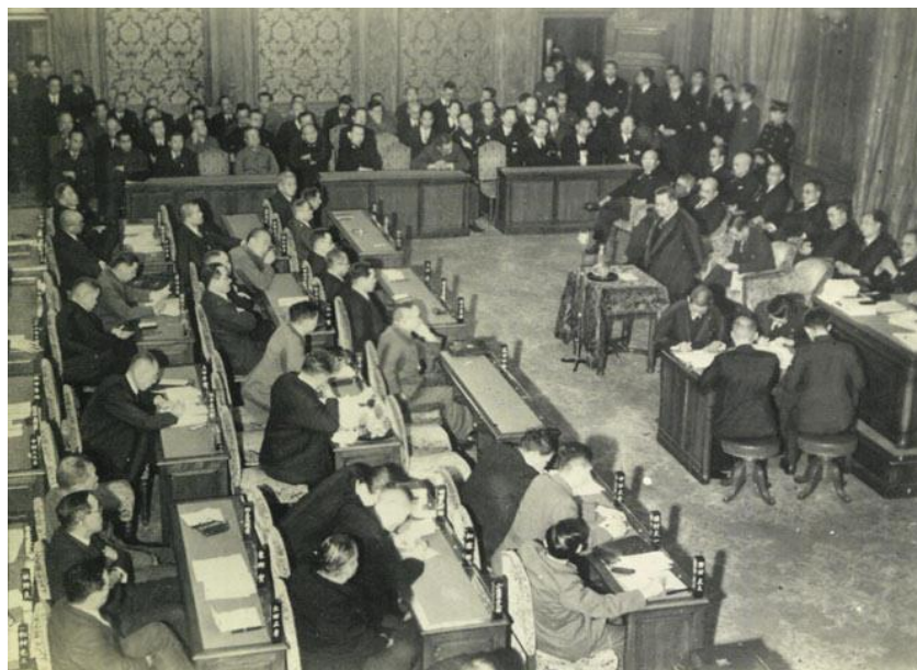
Finance Minister Kaya Okinori addresses Diet Budget Committee, 1944