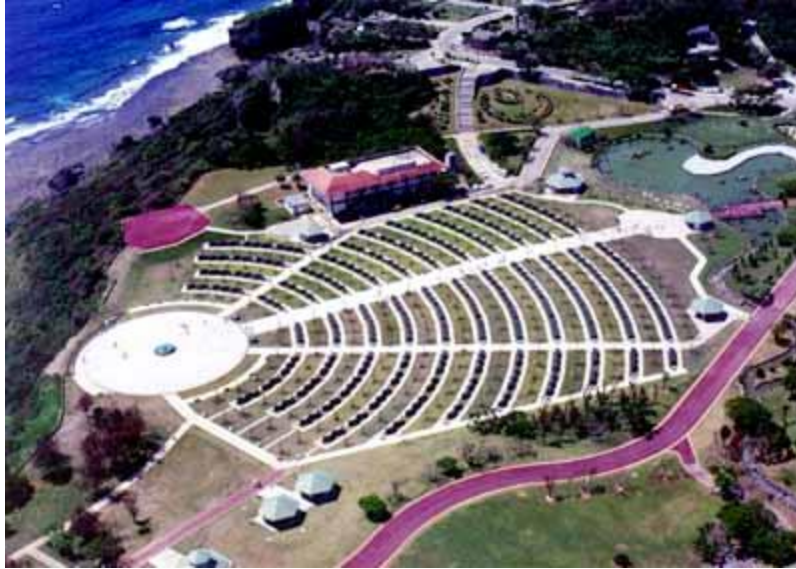
Cornerstone of Peace. More than 237,000 names of deceased civilians and soldiers are inscribed.

Yet for all its universalism, we note the continued stamp of the nation state in two important ways in the memorial spaces at Mabuni. First, the dead are arrayed in separate areas by nationality, and with Okinawans distinguished from mainland Japanese. Second, Mabuni Hill includes not only the Okinawan representations encapsulated in the Cornerstone of Peace and Konpaku-no-to, but the NOWC and the prefectural military memorials with their intimate ties to the Japanese military and Yasukuni Shrine. The mélange of memorials illustrates the conflicting approaches to commemoration between the Japanese state and Okinawan prefectural authorities. We may say that NOWC is a monument to war while the Cornerstone is a monument to peace. The Cornerstone of Peace is notable for its inclusiveness in commemorating the dead of all nations, its honoring of civilians and military victims of the Battle, and its partially successful attempt to transcend nationalist categories in search of universal peace. It is an achievement that has been realized in no mainland Japanese, American, British or German national commemorative site with which I am familiar. 12