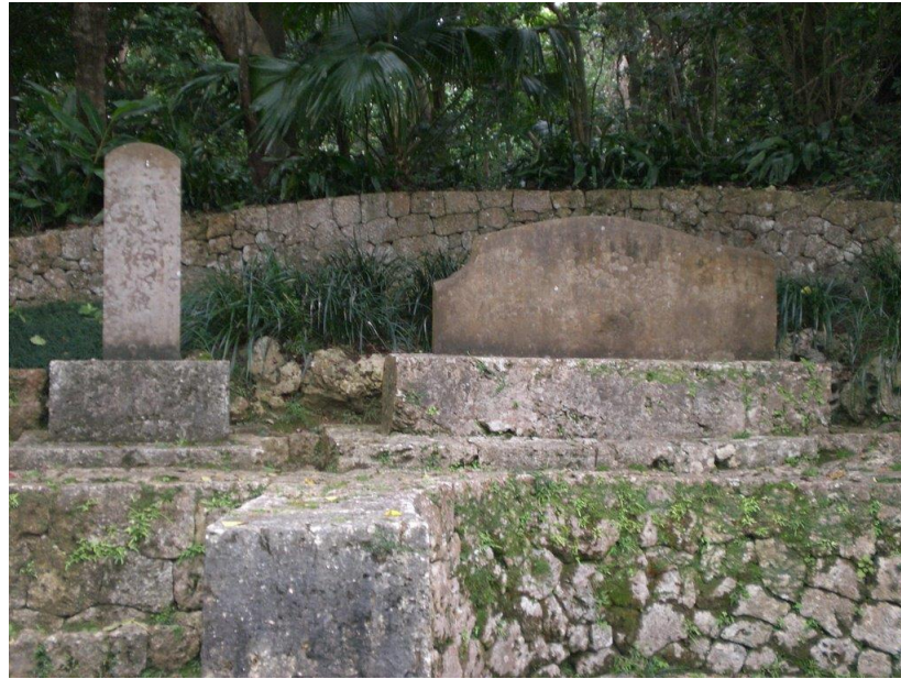
Monuments at Shikina

If Konpaku was the creation of Okinawan villagers, Shikina was primarily the product of GRI (that is, the US administration of the Ryukyu Islands) under pressure from Tokyo. Yet we cannot simply conclude that Konpaku embodied Okinawan sentiment while Shikina was the expression of Tokyo and/or the US. Both sites honored the military and the civilian dead, Japanese and Okinawan, although as we will note, with quite different emphases.