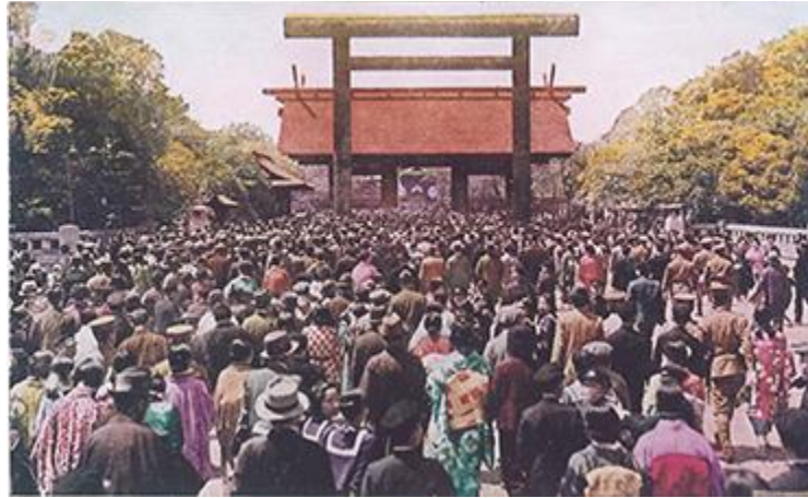
A festive crowd throngs the shrine in 1940

constituency, while implicitly legitimating the aims of colonialism and war for which so many Japanese soldiers and civilians died. 3