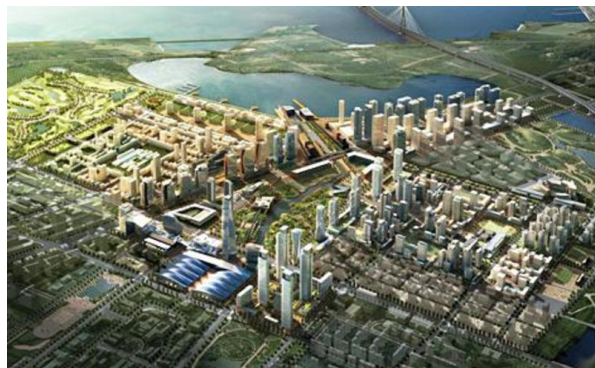
Songdo Smart City

On May 27 Ernst & Young Institute Japan (EY) released a Japanese-language study, summarizing Japan's over 200 smart city projects. EY's work is especially well timed. Among other recent developments, June 2 saw Apple join a long list of firms including Toyota Home 1 by entering the "smart home" market. 2 The global background includes thousands of smart-city projects, collectively worth at least USD 650 billion in 2014. 3 At over USD 40 billion, Korea's Songdo smart city project is the costliest private-sector real-estate development ever undertaken. 4