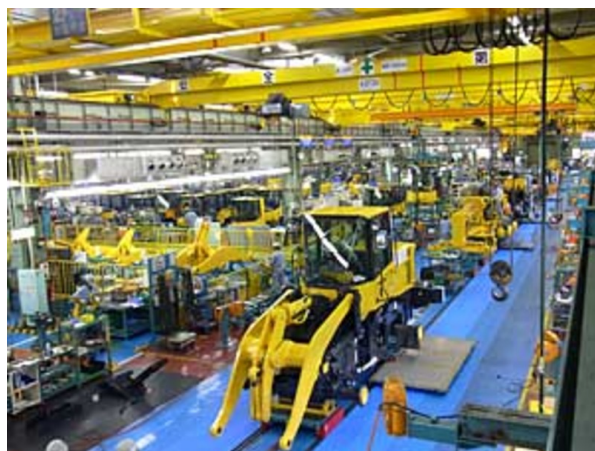
Komatsu assembly wing, Azawa

What is missing from the EY study, as well as from Japan's smart city effort as a whole, is benchmarking. The Abe cabinet should be doing this through the CIO office they set up to coordinate initiatives. The mind-numbing scale of our collective threat on resources as well as the scope of the business opportunity in smart cities suggest real leadership lies in taking up Koizumi's approach and – if not getting out of nuclear – at least getting on with the job of governing in the emerging smart cities sector. The vast welter of smart policies and projects in Japan needs a benchmark. One very instructive case might be the firm Komatsu, the world's second-largest producer of mining equipment. Komatsu's Awazu factory in Ishikawa Prefecture boasts a refurbished assembly wing whose power demand has been slashed a remarkable 92%. 39