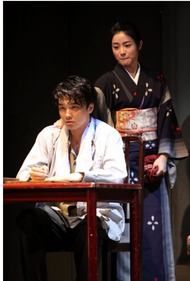
Inoue Yoshio is Kobayashi Takiji, Ishihara Satomi plays Taguchi Taki

In May 1921, again with the help of his uncle, he went on to high school in Otaru, but at the time he also left his uncle’s house. It was in October of 1921 that the beacon magazine of the proletarian literature movement, “Tanemaku Hito (The Sower)” was founded; and Takiji, barely 18, began writing stories and sending them to magazines. In July 1922 the Communist Party of Japan was formed, and, though illegal, issued its own magazine, “Zen’ei (Avant Garde).”