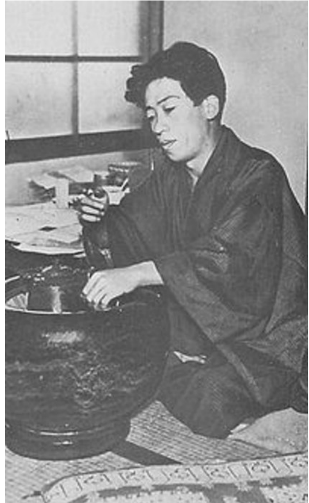
Kobayashi Takiji at work

This was the tragic end to the life of author and agitator, Kobayashi Takiji.