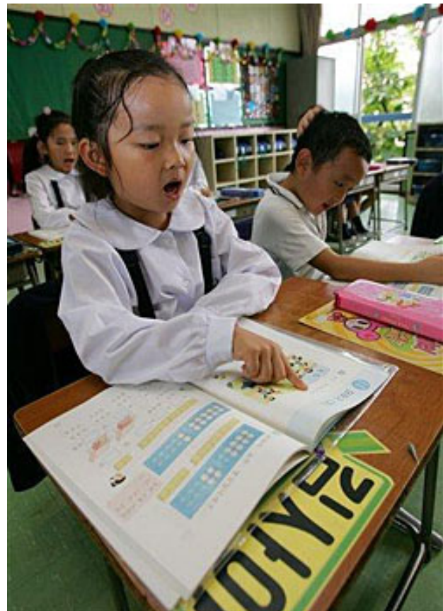
Resident Korean children at Chongryun school

Korean activists and Japanese educators who launched the multicultural educational movement in Osaka City respected the assertion of the 1948 protests, namely, Koreans' right to maintain the culture and identity of their homeland. The activists tried to maintain ethnic classes, which stressed the national culture of the homeland, and used those classes as a model for the ethnic classes they created. The city's Korean community, the largest in Osaka Prefecture, also stressed a culture orientation toward ethnic education. Koreans began to settle in Osaka in the 1920s and by the 1940s many operated independent businesses or were employed as skilled workers.[28] In those districts with high concentrations of Koreans, including Ikaino where about a quarter of residents were Koreans, Korean culture was played out in everyday life. The city was also home to many Korean political organizations, including the major branches of Mindan and Chongryun, which fostered political debate about the divided homeland among Koreans. These factors contributed to the formation of the ethnic-culture approach, which focused on the concept of ethnic nation ( minzoku ) as understood in relation to the Korean homeland. However, it was ultimately the political orientation of people involved in the movement that shaped Korean ethnic education.