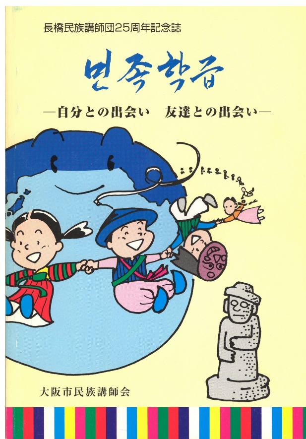
Booklet celebrating the 25th anniversary of the association of Korean instructors in Nagahashi

influential in shaping the content of ethnic education in Osaka City.