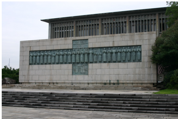
Front of the twenty-six martyrs museum, Nagasaki