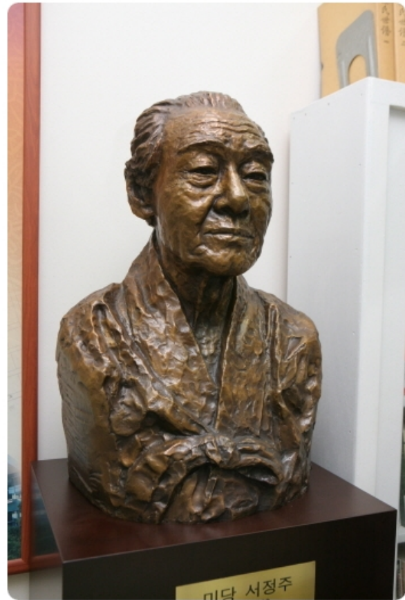
A bronze statue of Sō Jōng-ju. While respected as Korea's greatest poet, the controversy surround his work as a pro-Japanese writer continues to rage in Korea.

Sō Jōng-ju, perhaps post-liberation Korea's greatest poet, published a short story called “Postman Ch'oe's Military Longing” in October 1943, conveys understanding of the national identity “Japanese” as the internalization ( mi ni tsukeru koto ) of order and discipline. [8] In Sō's story, the protagonist, Ch'oe, a “postman in a small town by the sea in southern Korea,” is desperately trying to acquire Japanese identity. Ch'oe is a “reliable and trustworthy man of average build,” who delivers the mail not only in his own village, but also far and wide to “small villages in the deep mountains and down by the seashore.” Although his wife has passed away, he has a “mother who is blind in one eye,” and “a son who is a second-year student in elementary school.”