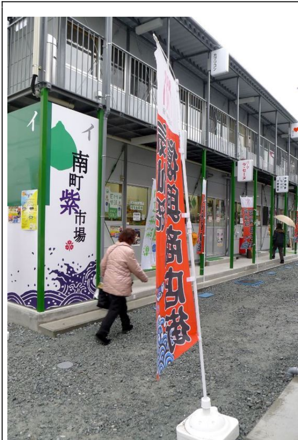
Fig. 2: The prefab Mina-machi Murasaki Ichiba (Violet Market) in Kesennuma, Miyagi Prefecture. Photograph by author, 11 March 2012.

The 3/11 daishinsai sparked a lively debate in the Asahi Shinbun and elsewhere about whether the crisis would occasion the spread in Japan of kifubunka , or “a culture of giving.” 8 On its website JACO (Japan Association of Charitable Organizations) lauded the temporary (five-year) post-3/11 tax reforms that allows individuals to either deduct from their income tax or to gain as a tax credit, 80% of their donations, up from the earlier limit of 10%; for incorporated donors, the entire amount of a donation (to registered outfits) is tax deductible. A recent permanent reform, building on progressive legislation passed in 1998 concerning the role of incorporated NGO/NPOs, allows individuals to either deduct from their income tax or to gain as a tax credit,