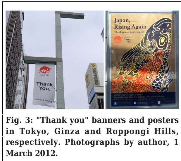
Fig. 3: "Thank you" banners and posters in Tokyo, Ginza and Roppongi Hills, respectively.

reconstitution of neighborhood and commercial associations that had been a casualty of the hellish tsunami and fire. Decisive local, regional and central leadership is crucial, he acknowledged, but not to the extent of extinguishing citizens' critical agency, especially if a community is regain its coherence and capacity for sustainability. 31