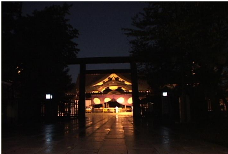
Yasukuni shrine at night.

Its name translates as “peaceful country,” millions have silently prayed there for an end to wars, and for much of the year the loudest sound is the buzzing of insects and the shuffle of old footsteps to the hushed main hall. Yet Yasukuni Shrine, which occupies a single square kilometer of central Tokyo, is one of the most controversial pieces of real estate in Asia, resented by millions who consider it a monument to war, empire, and Japan's unrepentant and undigested militarism.