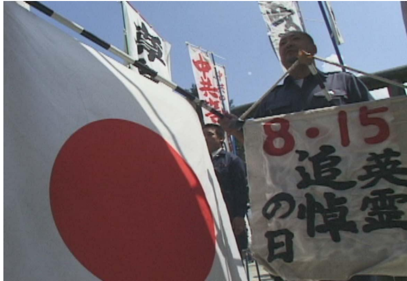
Former soldiers at Yasukuni on August 15, the anniversary of Japan's surrender in 1945.