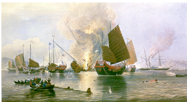
The First Opium War of 1840

The disintegration of the Qing in the early 19 th century set the stage for the onslaught of the Western imperialist powers in China and East Asia, bringing to an end the regional order and the protracted peace that had extended across East and Inner Asia to parts of Southeast and Central Asia.