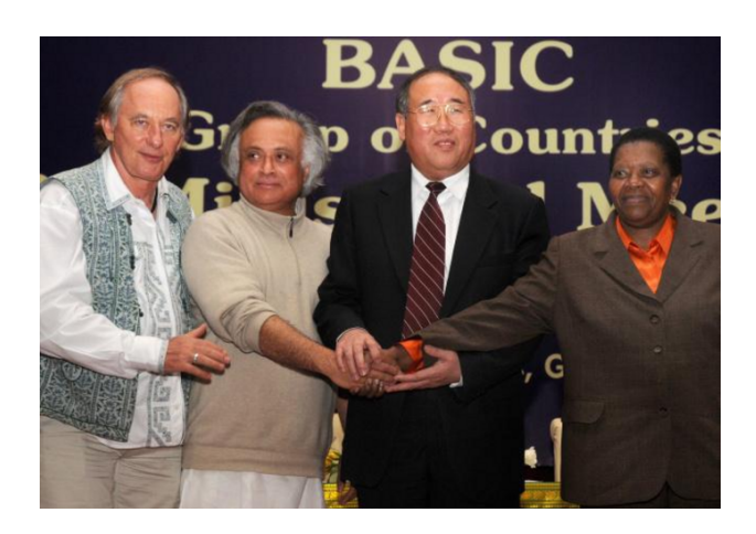
Representatives of the BASIC nations, Brazil, India, China and South Africa

The invoice was delivered by Brazil, South Africa, India, and China—the so-called "BASIC" nations--after their meeting in New Delhi on January 25.