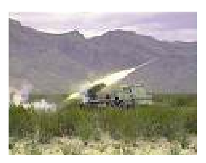
Hezbollah Katyusha Missile

Significantly, according to claims by both Hezbollah and Israel, Hezbollah has held in reserve all of its 200-odd Zelzal-2 missiles, which have a range of up to 200 kilometers -capable of reaching Tel Aviv. The Zelzal missiles are road-mobile, solid-propellant systems, about which little is known. They are most likely unguided or use a rudimentary inertial system; when properly launched, such rockets would be accurate to within several kilometers of their target, enough to hit a city like Tel Aviv.