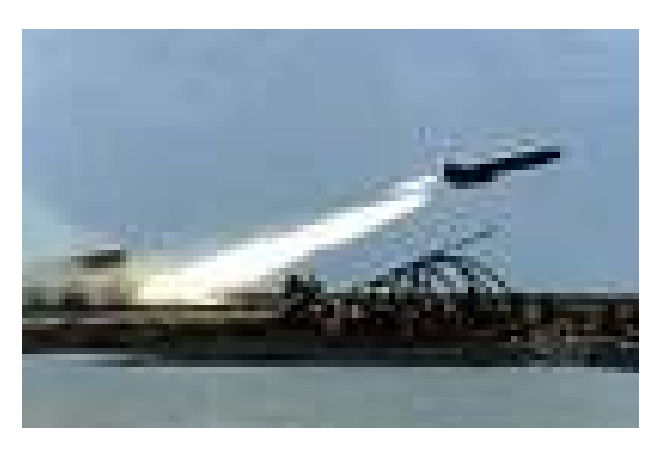
5. Chinese anti-ship Silkworm Missile

Hezbollah's recent use of an Iranian variant of the Chinese "Silkworm" C-802 radar-guided anti-ship missile against an Israeli warship illustrates the larger trend. In the wake of the Soviet Union's collapse, the first Gulf War demonstrated America's unparalleled global power, which flowed, in part, from possession of a new class of weapons with near-surgical accuracy at great distances. Fifteen years later, another shift in the balance of global military power is occurring as missile technology-particularly, the cruise missile technology that was a hallmark feature of U.S. military supremacy--is being democratized.