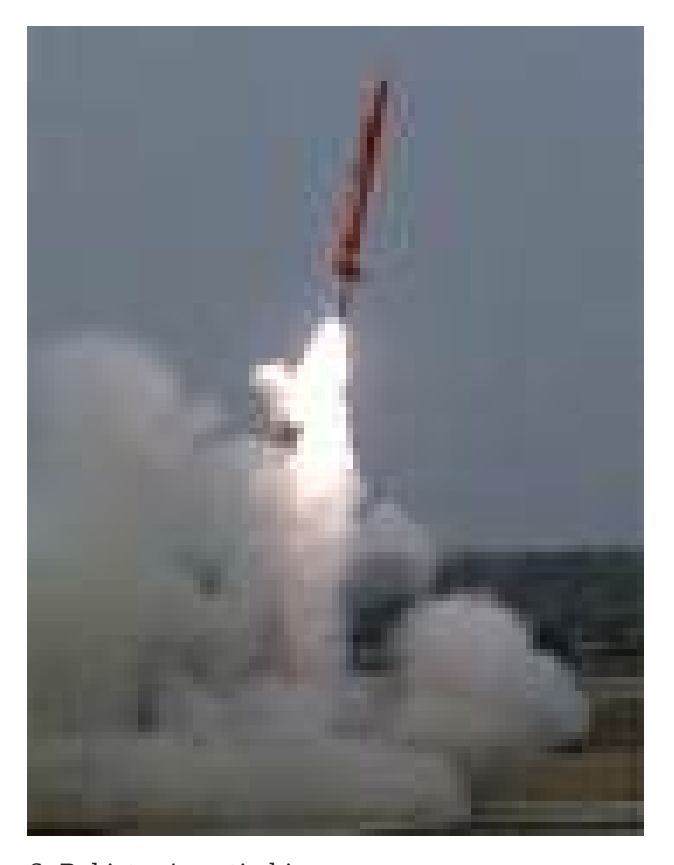
6. Pakistan's anti-ship Babur Cruise Missile

The Babur was, in a sense, Pakistan's predictable response to the test-firing in 2001 of the PJ-10 BrahMos cruise missile by its subcontinental rival, India. Jointly developed by Russia's Mashinostreyenia and India's Brahmos Corporation, the BrahMos's ramjet cruise engine is based on the Russian supersonic antiship Yakhont missile and capable of speeds of 2.5 to 2.8 Mach (three times faster than the Tomahawk). India and Russia ensured that the BrahMos didn't violate the MTCR, however, by keeping its range within the 300-kilometer limit specified for antiship cruise missiles.