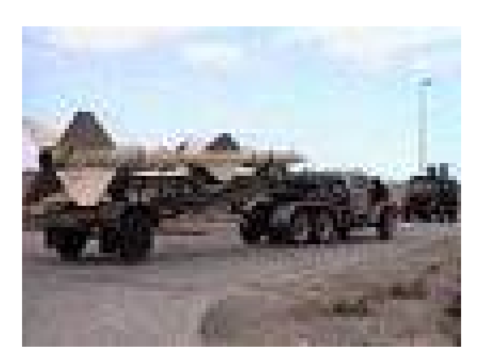
2. Iranian missile rocket

What are the possibilities for missile defense against the longer-range, Iranian-built rockets, such as the Fajr-3 and Fajr-5, with which Hezbollah hit Israel's third-largest city, Haifa, and as far south as Hadera in central Israel?