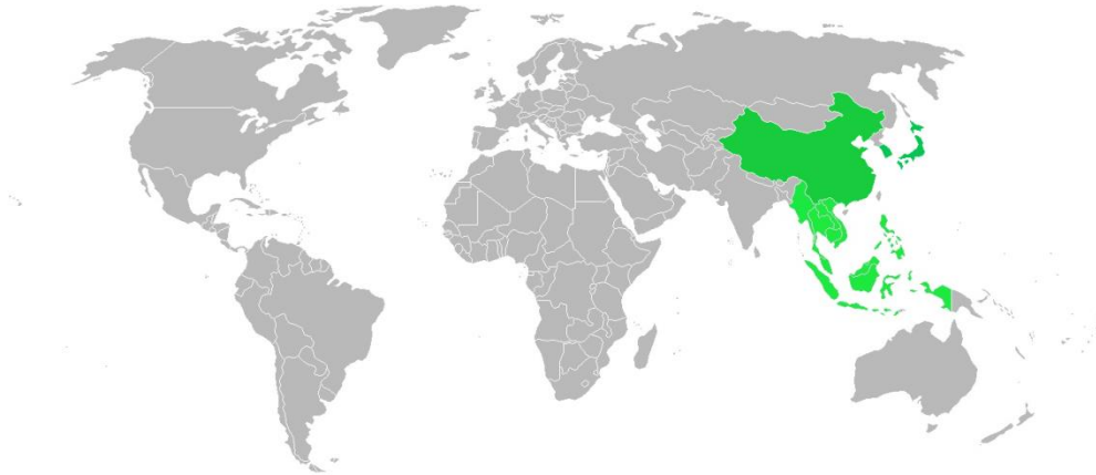
Map of ASEAN +3

hope to create an East Asian Community (Kyodotai) for peace, prosperity and progress.” ASEAN leaders supported that dream-like concept and in 2005 an East Asia Summit was held. However, Japan and China were in conflict about who should participate. The US, which was not invited, was dissatisfied, so the process has not been proceeding smoothly.