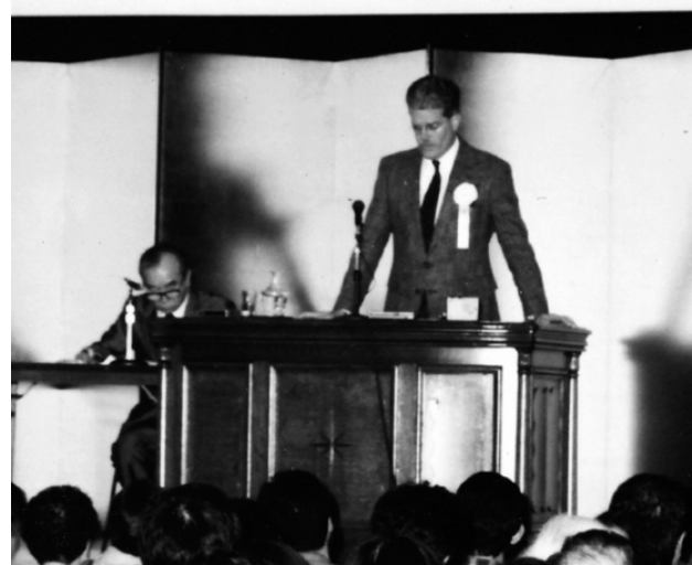
Bruce Cumings giving a lecture at a "40th Anniversary of the Korean War" event in Tokyo in 1990 (Source: Hankyoreh, August 23, 2009).

As an anti-war protestor in a situation where nobody knew my name, let alone my views, I would just be going from Columbia down Broadway with a few thousand people marching to Times Square to oppose the war. I was very conscious of how things like that are only valued and only make a difference when they're really voluminous, when masses of people take part. That's what was happening then. That along with the North Vietnamese and the Vietcong basically defeating the US during the Tet Offensive in 1968. You can see from early 1968, the US was going to lose the war, but Nixon prolonged it for five bloody years. It led to protests not just on the elite campuses like Harvard or Chicago or Columbia, but also places like Kent State University, where four students were killed during a rally. This led to strikes on every campus, virtually every campus in the country.