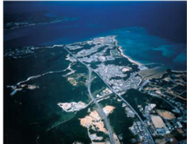
Camp Schwab, Eastward to Henoko Point and Oura Bay.

The “Roadmap” was a follow-up to the December, 1996 Japan-U.S. Special Action Committee on Okinawa (SACO) agreement which promised to return “approximately 21 percent of the total space of the US facilities and areas in Okinawa excluding joint use facilities and areas (approx. 40 square kilometers),” including the MCAS Futenma and a large portion of the 50 square kilometer Northern Training Area. The closure/return of each of the facilities/areas was contingent on relocating most of their functions within Okinawa. The MCAS Futenma, for example, would be returned “within the next five to seven years” after a sea-based facility (SBF) was established off the Henoko peninsula near the Marine Corps Camp Schwab training complex on the northeastern coast of the main island of Okinawa. The floating base, connected to land by a pier or causeway, was chosen over two other alternatives—incorporating the heliport into the huge Kadena Air Force Base or building a heliport at Camp Schwab. The heliport, the two governments suggested, would enhance “safety and quality of life for the Okinawan people while maintaining operational capabilities of U.S. forces and could be removed when no longer necessary.”