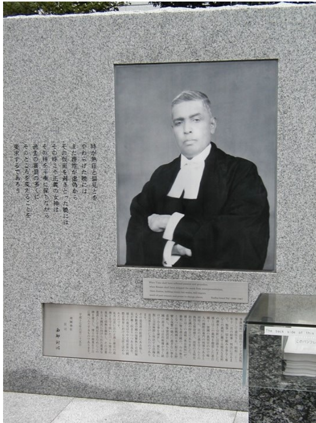
Monument to Radhabinod Pal in Japan