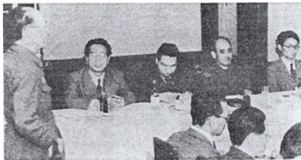
Miki Kiyoshi (second left) at a meeting of the Shōwa Kenkyūkai

with the German tradition of the philosophy of history.[92] According to Miki, the over-Westernization of world cultures and the Eurocentric character of the social sciences posed a global political problem. Borrowing the self-critique of European thought during the interwar period, Miki expressed the conviction that Western civilization was in the process of self-destruction and could no longer dominate the fate of Asia. From this observation, he proceeded to the conclusion that Japan should uphold its civilizational mission to facilitate Asian unity and cooperation and eliminate Western colonialism. For Miki, Asian cooperation under Japanese leadership would serve the interests of peace and harmony, as well as liberation and racial equality.[93]