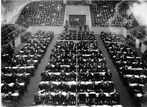
League of Nations Assembly, 1932

As the foreign policy Ôkawa had envisioned began to be implemented, he was put on trial for his involvement in the May 15, 1932, assassination of Prime Minister Inukai Tsuyoshi.[34] After his arrest on June 15, 1932, the court found Ôkawa guilty of providing guns and money to conspirators during the planning stage of the assassination. In February 1934, he received a fifteen-year prison sentence, however, between appeals and paroles he spent less than two years in prison, between June 1936 and October 1937.[35] Between 1931 to 1935, the dominant visions of Japanese foreign policy and domestic politics changed so dramatically that, by early 1935, Ôkawa no longer needed to work through secretive radical organizations to achieve his ideological goals. In February 1935, he marked the end of his career as an activist promoting the Shôwa Restoration in domestic politics and pan-Asianism in foreign policy by disbanding the last organization he established, Jinmukai.[36] Japan itself was approaching the state of military mobilization while endorsing an Asianist foreign policy agenda, making radical activism for the same purpose pointless.