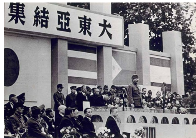
Subhas Chandra Bose in a Tokyo speech in 1945

for the cause of Indian freedom." [103] According to Bose, the Greater East Asia Conference organized by the Japanese government as an alternative to the League of Nations was receptive to nationalist voices in Asia in a way none of the European-centered international organizations had ever been. Meanwhile, he gave several radio speeches and lectured to the Japanese public, helping to enhance the popular Japanese confidence in the liberation mission of the Pacific War.