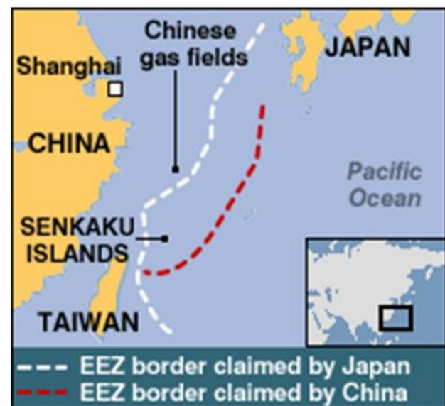
East China Sea map

in the East China Sea through the conclusion of a bilateral treaty (2). As of now no round of negotiation has yet begun which gives an indication of the magnitude of problems.