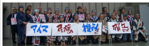
An Ainu protest, one month before the government's June 2008 proclamation, says "Establish the Rights of the Ainu People."

While 1997's Ainu Cultural Promotion Act (ACPA) and the government's 2008 proclamation should not be viewed as unqualified or climactic successes, the two events do represent very significant success for the Ainu as steps along paths of political and cultural resistance. The ACPA superseded the 1899 Former Aborigines Act and created a foundation to promote Ainu culture. The "Resolution calling for the Recognition of the Ainu People as an Indigenous People of Japan" on 6 th June 2008, was passed unanimously by both house of the Japanese Diet, and represented the attainment of a goal, long sought by Ainu people across Japan. 26 Neither event would have been possible without Ainu agency, working in domestic and international political arenas and developing a flexible profile of their own culture and identity.