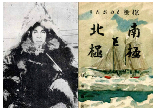
Shirase Nobuo and the Antarctic Expedition of 1912

The issue of land rights, important for any indigenous people, might seem to leave little room for manoeuvre in Ainu-Japanese negotiations, with UNDRIP stipulating that indigenous rights should not damage the territorial integrity of existing states. But the Ainu are one of few indigenous peoples in developed countries without their own land, and this is clearly a direction in which Ainu activism will push further. Shimin Gaikou Sentô, a Japanese NGO, has produced a guide to help Ainu fully understand and exercise their rights. The guide, "An Explanation and Usage Guide to the UN's Declaration on the Rights of Indigenous Peoples, for the Ainu", includes