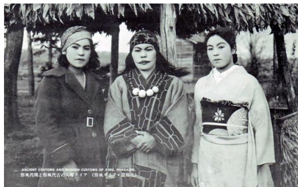
Ainu women pose in traditionally

Discourse on indigenous peoples tends to be a discourse of unhappiness. Most groups have experienced distressing cruelty, and narrative accounts of their struggles tend to be elegiac in tone. Japan's Ainu people have undergone suppression of their culture and livelihood, and subsequent denial of their existence. However, this article critically re-evaluates the Ainu's recent history in terms of their considerable achievements, such as international recognition and the Japanese government's 2008 declaration recognising their indigenous status. In spite of and often in reaction to continuing obstacles, the Ainu have successfully used international fora to advance towards their domestic goals. Simultaneously, they have often reshaped their culture to successfully engage with contemporary demands.