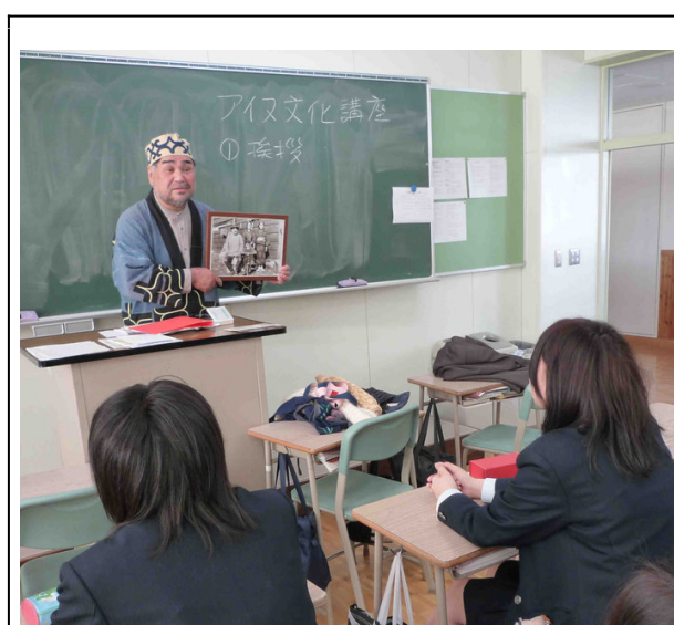
School children learn about the Ainu in Kushiro, Hokkaido