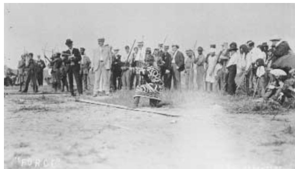
Ainu compete in archery contest at 1904 Anthropology Days, from Celebrating the Louisiana Purchase

Ainu abroad. At the 1904 St. Louis World Fair's Anthropology Days and the 1910 Japan-British Exhibition in London, groups of Ainu were displayed by the Japanese state as a way of marking their own cultural and racial superiority. 9 The Ainu were considered "characteristic of the lowest culture" 10 and as symbolising, by contrast, Japan's power and modernity. 11 There were negative stereotypes of the Ainu and even legal prohibitions against them concerning physical appearance and customs. 12 The racially and culturally exclusionist Japanese bureaucrats of the 1930s took an interesting angle on eugenics by promoting mixed marriages, and arguing that hybrids would be "born almost as Japanese" and that "mixed blood children take after the superior race." 13 Many Ainu left their homes and found solace in the anonymity of Honshu's cities, while those who stayed on Hokkaido could usually only find work as labourers and continued to face discrimination. 14