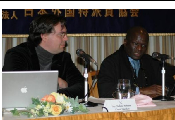
Doudou Diene in Japan.

Following the General Assembly's acceptance of UNDRIP, the Ainu called for recognition "as an indigenous people... with their own unique language, religion, and culture", and invited the government to "seize the opportunity presented by adoption of the Declaration on the Rights of Indigenous Peoples... to work towards establishing a comprehensive Ainu policy." 46 An Indigenous Peoples' Summit was strategically timed for July 1 st to 4 th 2008 to precede the 34th G8 summit also scheduled for Hokkaido, from July 7 th . Aware of these arrangements, and fearful of the criticism further delay would bring, the government declared the Ainu to be Japan's indigenous people on June 6 th ; marking a clear success for the Ainu and their mobilisation of international pressure to further their domestic aims. The resolution refers directly to UNDRIP, the convening of the G8 summit in Hokkaido, and the growing trend of international society to enable indigenous peoples "to maintain honour and dignity and transmit their culture" to the next generation. 47