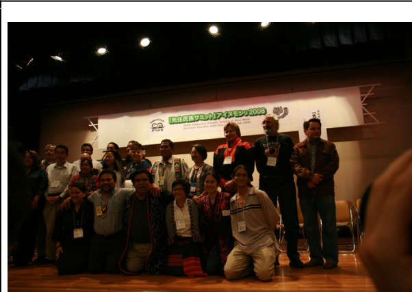
2008 Indigenous Peoples Summit, Hokkaido.

Following the General Assembly's acceptance of UNDRIP, the Ainu called for recognition "as an indigenous people... with their own unique language, religion, and culture", and invited the government to "seize the opportunity presented by adoption of the Declaration on the Rights of Indigenous Peoples... to work towards establishing a comprehensive Ainu policy." 46 An Indigenous Peoples' Summit was strategically timed for July 1 st to 4 th 2008 to precede the 34th G8 summit also scheduled for Hokkaido, from July 7 th . Aware of these arrangements, and fearful of the criticism further delay would bring, the government declared the Ainu to be Japan's indigenous people on June 6 th ; marking a clear success for the Ainu and their mobilisation of international pressure to further their domestic aims. The resolution refers directly to UNDRIP, the convening of the G8 summit in Hokkaido, and the growing trend of international society to enable indigenous peoples "to maintain honour and dignity and transmit their culture" to the next generation. 47