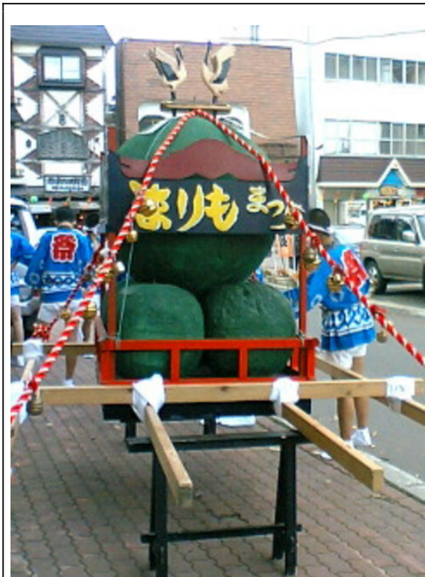
School children with Marimo Shrine.

Tourism in Hokkaido developed rapidly from the 1960s and '70s. In response, 1971 saw an Ainu museum set up in Nibutani. 88 In 1976 an Association for the Maintenance of Ainu Intangible Culture was formed. Then in 1988 an Ainu cultural festival was held in Sapporo. Within this time frame it would be arbitrary to distinguish a "history of tourism" from a process of growing Ainu self-awareness and self-education in the spheres of tangible and intangible culture. But the complex process of cultural self-promotion has left room for sharply differing attitudes towards it. The idea of indigenous tourism as involving the secularisation and impoverishment of culture is familiar. On the other hand, some young Ainu today view Ainu traditionalism very negatively. 89 It can be argued that many Ainu willingly chose assimilation to "Japaneseness". 90