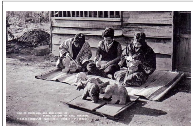
Ainu construct and engrave bear figures. Postcard, date unknown.

drastically reduced by Meiji government policy.