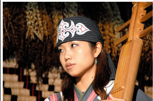
Ainu girl holding tonkari, a five-string zither.