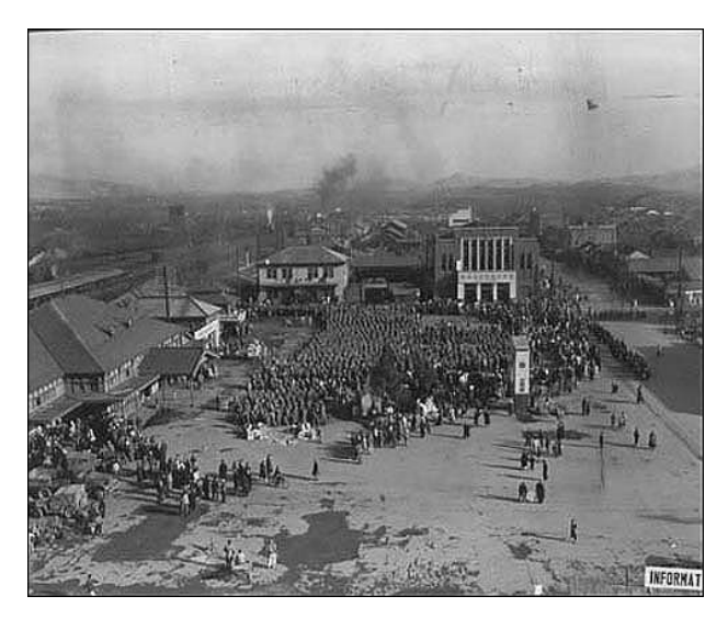
Daegu railway station, 1950

This event was part of a momentous development in postwar Korea, in which villagers and townspeople across South Korea began assembling in public spaces to demand justice for their relatives killed unlawfully before and during the Korean War. In 1960, South Koreans experienced a brief period of political democracy after student-led protests brought down the US-backed postwar regime of Syngman Rhee. Immediately after the democratic revolution, a number of local associations of bereaved families were established, which soon expanded to a national assembly of the families of the victims of the Korean War civilian killings. Some of these local associations took the initiative to open the mass graves of the victims. The associations reburied the remains of their relatives and held collective death-commemorative rites at the new collective tombs. The National Assembly of Bereaved Families hoped that the parliamentary inquiry would change the status of their relatives from collaborators with communism to victims of state violence.