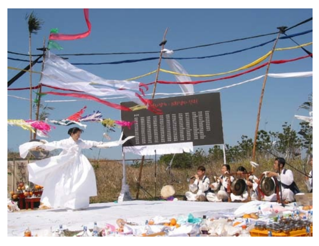
Rite of spirit consolation, Jeju

the government had earmarked before the war as communist sympathizers or potential collaborators with North Korea. An estimated one hundred thousand civilians are believed to have been killed by this extraordinary state-ofemergency measure taken in the first few weeks of the Korean War. The dead included inmates of national and provincial prisons, who were held there on charges of political crimes relating to the social unrest and political conflicts of postcolonial Korea since the nation's liberation from Japan's colonial rule in August 1945 at the end of the Pacific War and the subsequent division of the nation between the Soviet-occupied north and the US-occupied south.