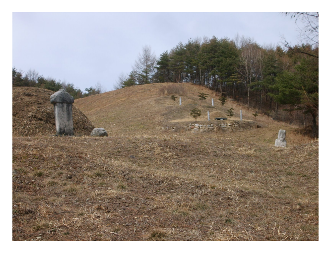
Miryang graveyard closeup

hundred ancestors? What happened in their genealogical history that their lineage has fallen to the current anomalous situation of minimal existence?