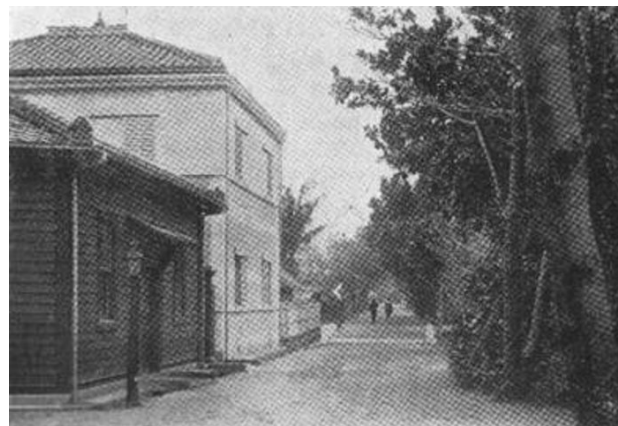
Bonin Island post office and main street

state through such authoritarian apparatuses as government departments, hospitals, schools and prisons. With Japan's modernization, the koseki, as an instrument of surveillance and control, became ubiquitous throughout processes of social administration.