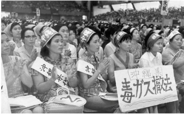
Poisoned ties: Okinawan women hold placard reading "Remove poison gas from Okinawa" at a Japan Mothers Association meeting in 1969 in Tokyo, just weeks after a poison gas accident at a U.S. installation on the island.

In 1961, as the Cold War deepened, the U.S. initiated a comprehensive overhaul of its defensive capabilities in more than 100 different categories; No. 112 on this list was the study of CBW. Envisaged by President John F. Kennedy's secretary of defense, Robert McNamara, as "an alternative to nuclear weapons," Project 112 proposed experiments in "tropical climates" and, to evade laws regulating human testing in the U.S., it suggested the use of overseas "satellite sites." 9 Fulfilling both prerequisites, Okinawa must have seemed a perfect choice. In particular, the Northern Training Area in the island's Yanbaru jungles must have been a particularly tempting target for U.S. scientists since it was (and continues to be) the Pentagon's prime tropical guerrilla training center.