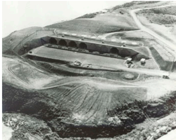
Another of the Mace bases in Kin, Okinawa, is pictured in the early 1960s.

a fratricidal ideological debate over communism's future. However at the time, the Pentagon continued to operate on the assumption that the two countries were allies. This misconception laid the basis of America's infamous blueprint for atomic war the Single Integrated Operational Plan dubbed by one government adviser as a "massive, total, comprehensive, obliterating strategic attack on everything Red." 5 While JFK had made token changes to the plan in early 1962, the amendments apparently hadn't filtered down to the missile control center on Kadena.