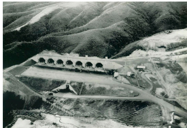
Ominous holes: An aerial photo shows the Mace missile base in Onna, Okinawa, in the early 1960s.

Mingled with the missileers' fear, though, there was also a sense of professional rivalry as the men compared their own Maces with the grainy spy-plane footage of the Soviet missiles and reassured themselves that the SS-4's appeared technically inferior. Furthermore, they experienced a complex sense of excitement that they might finally be given a chance to put their hard months of training into practice.