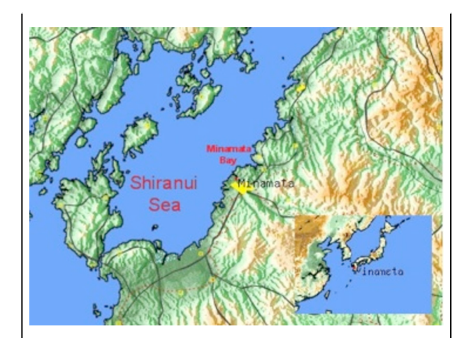
Minimata, and the Minimata Bay within the Shiranui Sea

Taking place in a developmental state, Sea of Suffering depicts government-sanctioned environmental exploitation for economic development; Chisso's close ties with the government are part of an industrial policy organized by private businesses and the national bureaucracy. So, not surprisingly, the narrator of Sea of Suffering explicitly condemns state-sanctioned capitalism for encouraging the sacrifice of human life for financial gain. She repeatedly censures the unchecked desire for profits that led Chisso first to dispose of its untreated waste in the waters surrounding Minamata without ascertaining that this would not harm local residents, then to continue doing so even after the toxicity of its emissions became indisputable; she denounces the analogous greed that for decades enabled the Japanese government to condone Chisso's actions, in practice if not always in legislation. The narrator also frequently reproaches Chisso and the Japanese government for failing to admit responsibility, much less compensate or provide medical care, for people suffering from Minamata disease. And she asserts that not only the government and Chisso are to blame; many living in the long-impoverished Minamata region were so grateful to the company for improving their standard of living that they