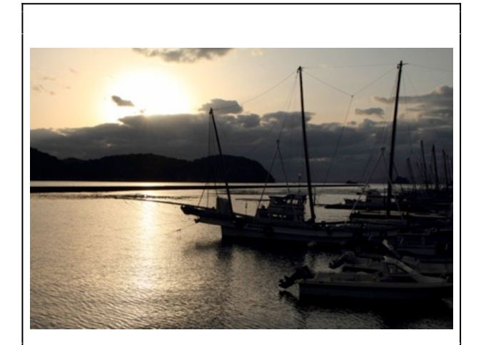
Shiranui sea scene

found, albeit far from Minamata. Asking rhetorically if there is anything more beautiful than fish, Yuki underscores her wonder for the natural world; she implies that even the magnificent, imagined Palace of the Dragon King is not as glorious as these aquatic animals. The sea that houses fish (in actuality) and palaces (at least in the imagination) pulls at her ever more insistently.