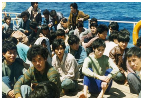
Fujian undocumented migrants on the deck of a fishing boat.

Accompanying payment for the visa, there were also extra costs was associated with pooling money. Only a few families already had members working abroad and therefore could afford the initial costs. Most immigrant families borrowed at high interest (usually 1 percent every month) or obtained loans through rotating credit associations. Many Fujian students had to quit school and become visa-overstayers because of the financial burden.