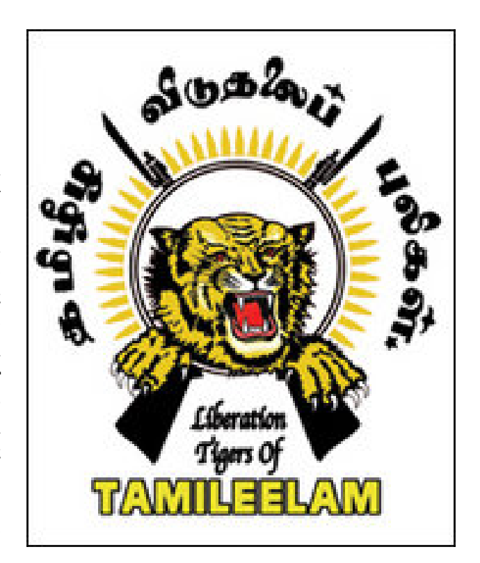
Tamil Tigers Emblem

While the world's attention is focused on record high oil prices, water, like oil, is increasingly emerging as a catalyst for international instability and conflict as the recent upsurge in violence in Sri Lanka illustrates. On July 20, the Liberation Tigers of Tamil Eelam (L.T.T.E.) shut down the Maavilaru dam's sluice gate near the town of Kantalai in the northeastern Trincomalee district, which cut off water supplies for 60,000 people in governmentcontrolled areas. This led the Sri Lankan military to commence an aerial bombardment of Tiger positions and a ground offensive to gain control of the reservoir's control point. The Tigers claim that their actions were sparked by the government's failure to build a water tower to supply L.T.T.E.-controlled areas and responded by going on the offensive in Mutur. With more than 500 people killed since fighting erupted over the disputed waterway, the 2002 ceasefire has now collapsed in all but name.