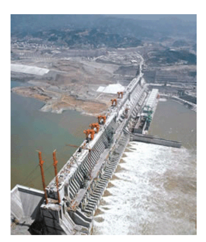
Three Gorges Dam

While the world's attention is focused on the Three Gorges Dam, which was completed in May 2006, less attention has been paid to a number of other massive dam projects under construction or consideration in China. China's dam-construction binge has been fueled by its growing energy needs, the appeal of hydropower as a clean fuel, the need for flood control, as well as the interest in massive infrastructure projects by provincial governments in order to boost their growth figures.