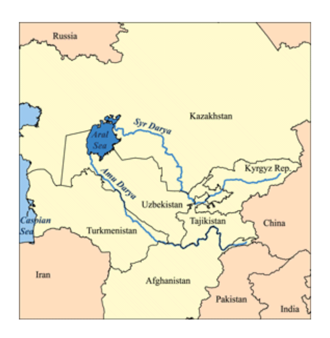
Syr Darya and Amu Darya

Kazakhstan are the region's main water consumers with Uzbekistan alone consuming more than half of the region's water resources. As such, Kyrgyzstan and Tajikistan control the water needed by the other Central Asian states. The upstream states, however, view water as a strategic commodity as they are poorly endowed with other resources and use water to generate much of their own power needs.